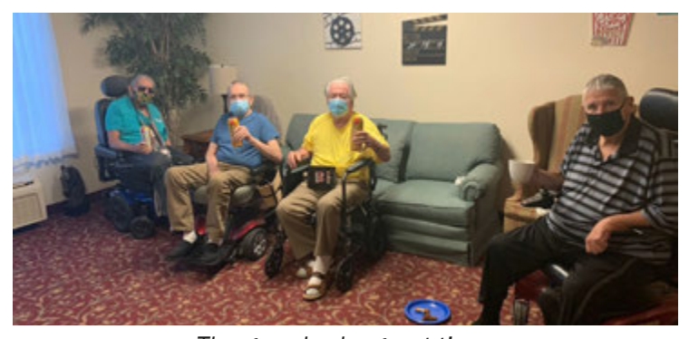
The guys had a great time.