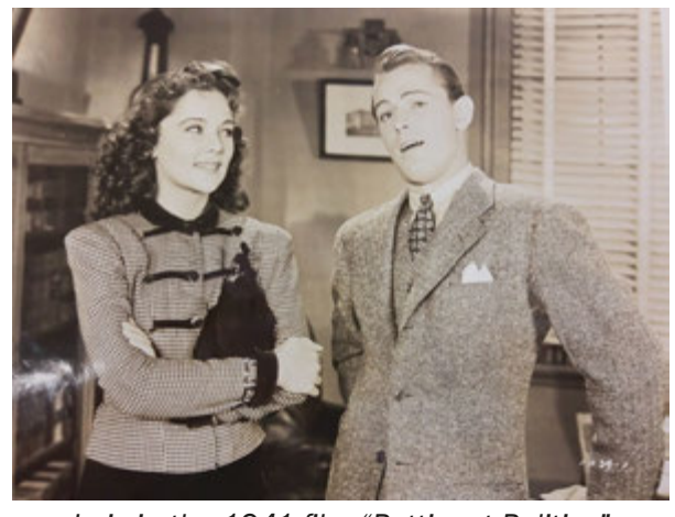
Lois in the 1941 film "Petticoat Politics"