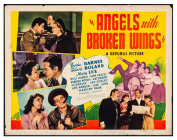
Movie poster for "Angels With Broken Wings," 1941