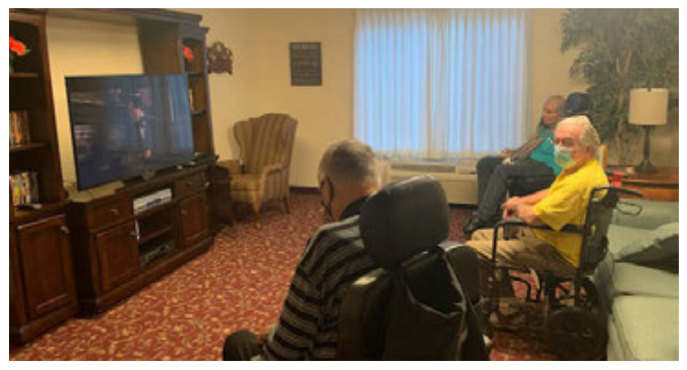
This week we watched the film "Men of Honor."