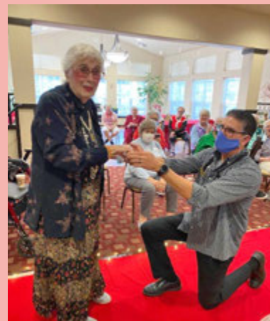
The marriage proposal at 96 years old — greatest skit of all time!