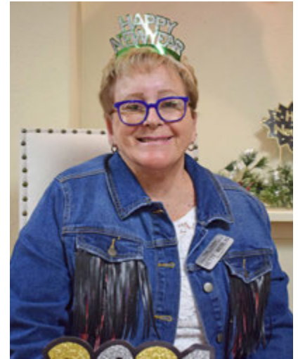
"Limitless is your potential. Magnificent is your future." — Bette W.