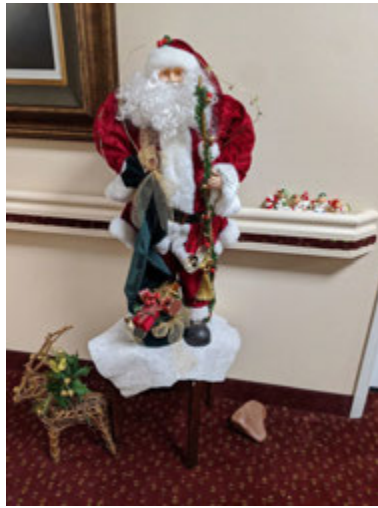
Most Holiday Spirit