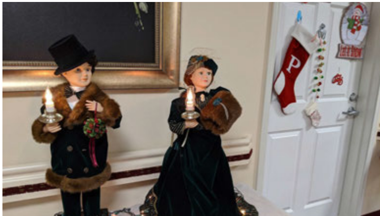
Most Holiday Spirit