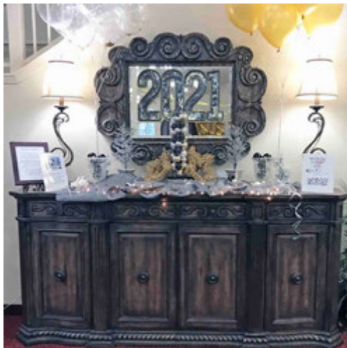
Decorations for 2021!

It's safe to say that no one was sad to see 2020 come to an end, as a lot of our residents came to celebrate at Cottonwood Estates' New Year's Eve Bash.