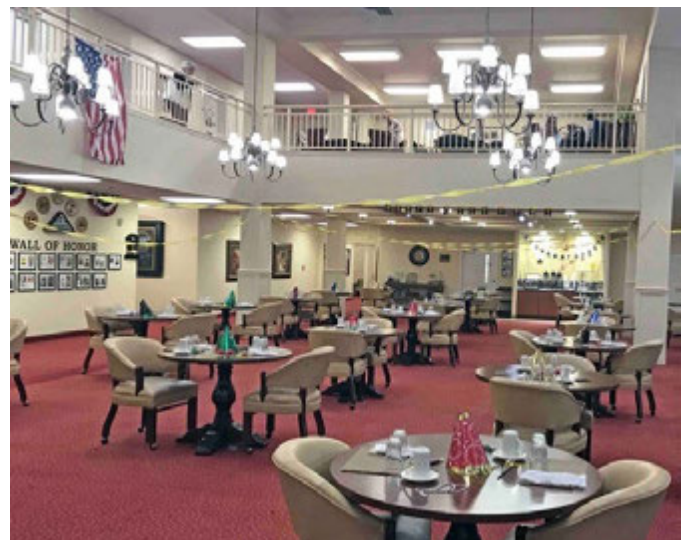
Ready to party!