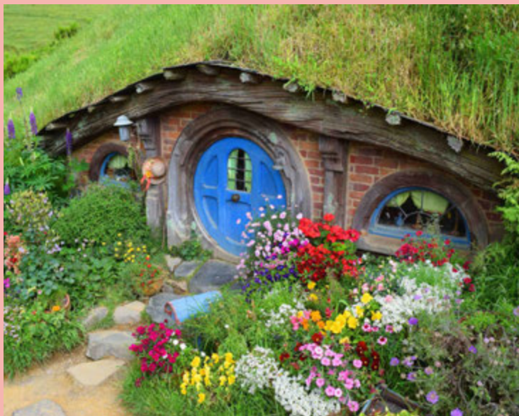
What an enchanted house!