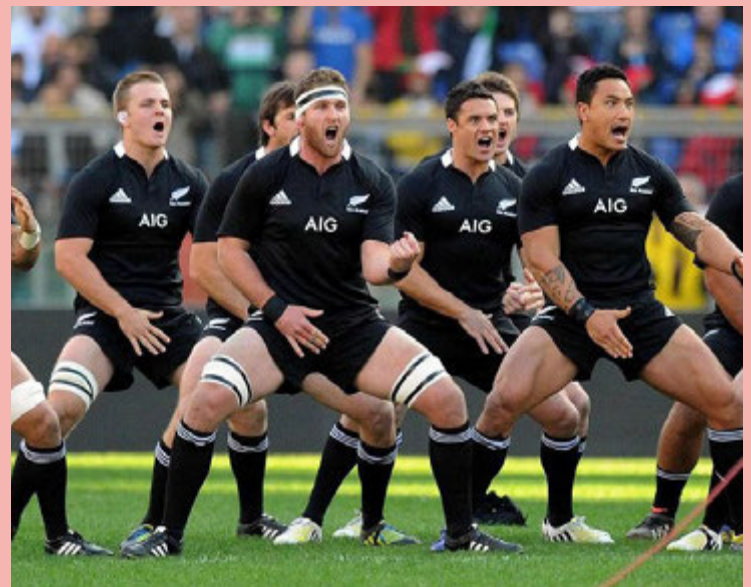
It's time for a HAKA!