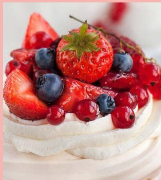
Yummy — looks delicious!

Our March newsletter will have many of the pictures from our Hawthorn Adventure trip.