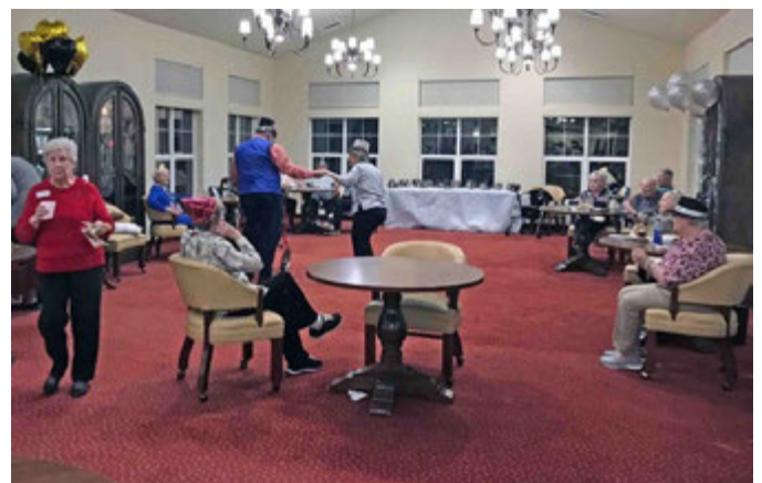
Let's dance the night away!