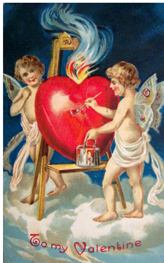
Yeah Valentine's Day!

Our residents here at Cottonwood will be celebrating on February 14th, Sunday with a party with lots of red balloons, candy, music and dancing.