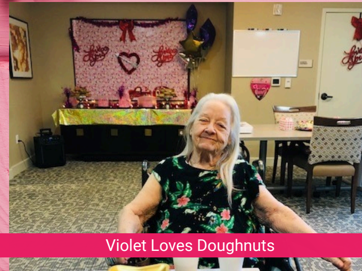
Violet Loves Doughnuts

Kingston Bay Senior Living 6161 West Spruce Ave Fresno Ca. 93722 559-479-4700