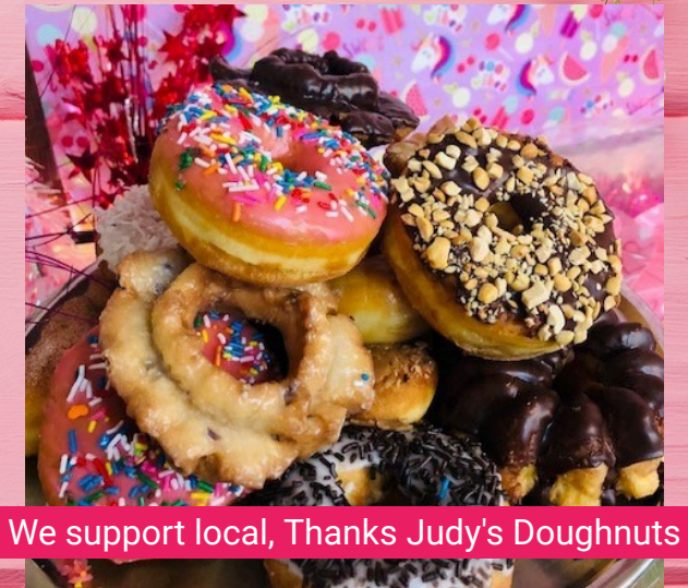
We support local, Thanks Judy's Doughnuts