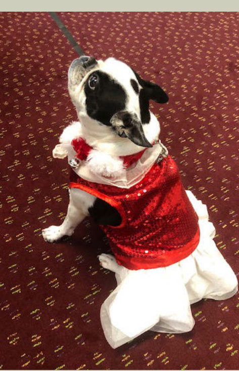
Emma is all dressed up for Christmas!