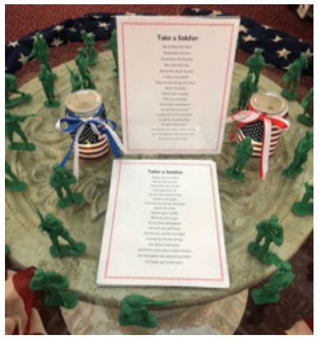
Our "Take A Soldier" table in remembrance of all who served, are currently serving, and for those who made the ultimate sacrifice