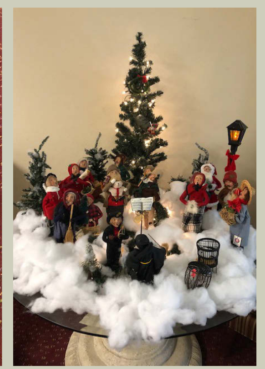
Thank you for setting up this beautiful display for us, Jack!