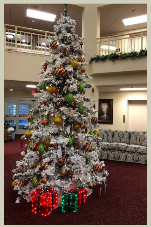
What a beautiful Christmas tree!