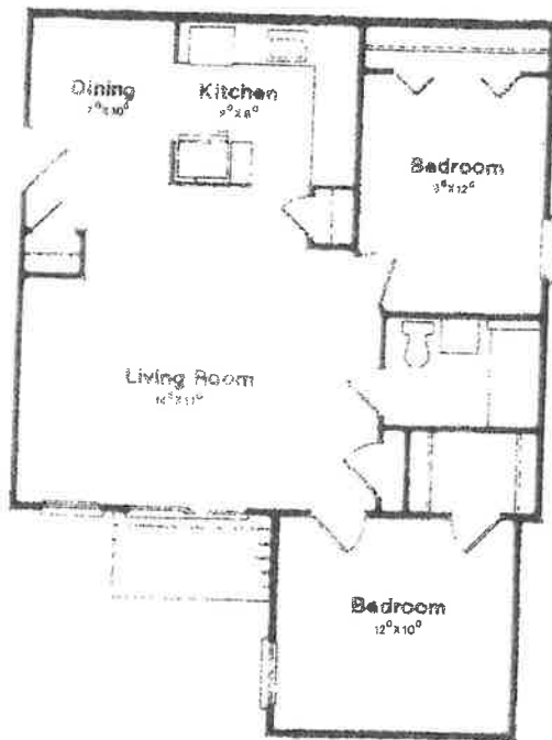
Two Bedroom Apartment