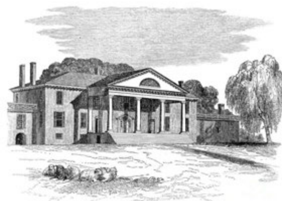
Original rendering of Montpelier