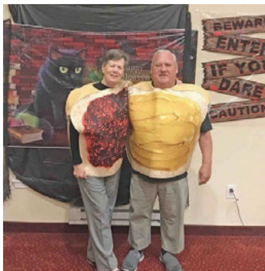
Peanut Butter and Jelly!