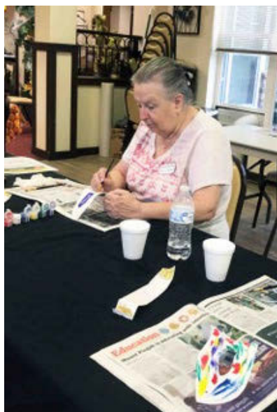
Let's get creative!