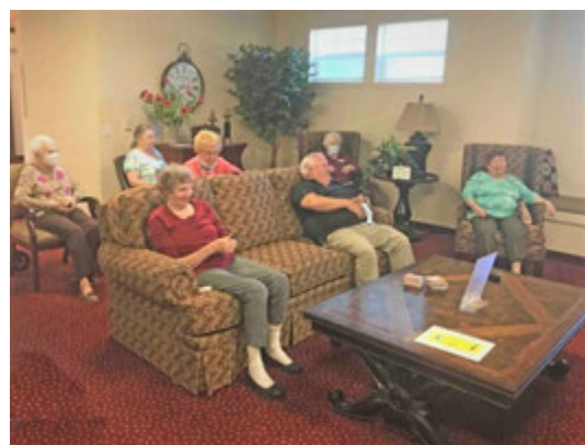
Let's get started!