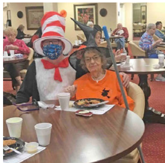
The Cat in the Hat meets a nice witch!