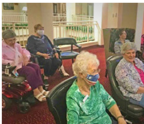
Time for some fun!