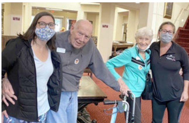
Let's go vote!

It was time to go vote for 2020 election. Several of our residents were driven to the polling station to make their vote count. This voting season was a little more challenging