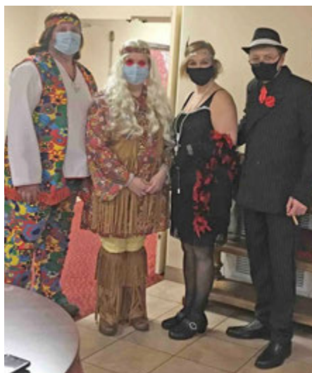
Managers ready to party