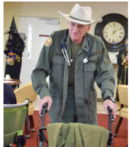
Hawkeye from Mash