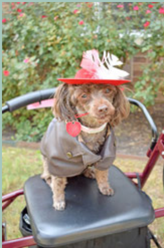
First Place Top Dog: GiGi