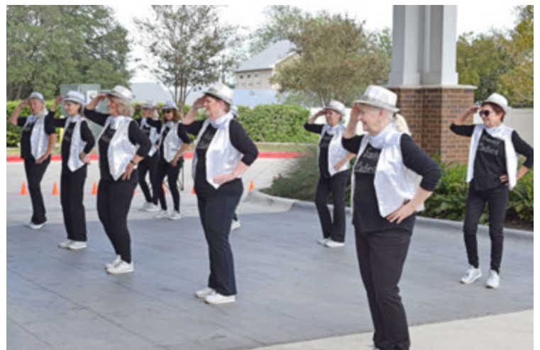
The Sassy Ladies put on a fantastic dance performance under the Bus Port.