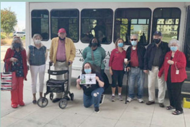
Our Cowboys’ Crew!

We took our “drive to nowhere” about 25 minutes away to Prosper where Dak Prescott lives. He is the quarterback for the Dallas Cowboys and we all knew he was home with an injury. It wasn’t a gated community, but a gated driveway, so we were able to get right up to his house. He didn’t come out and say “hi” but we took plenty of pictures and thoroughly enjoyed the beautiful weather for the drive!