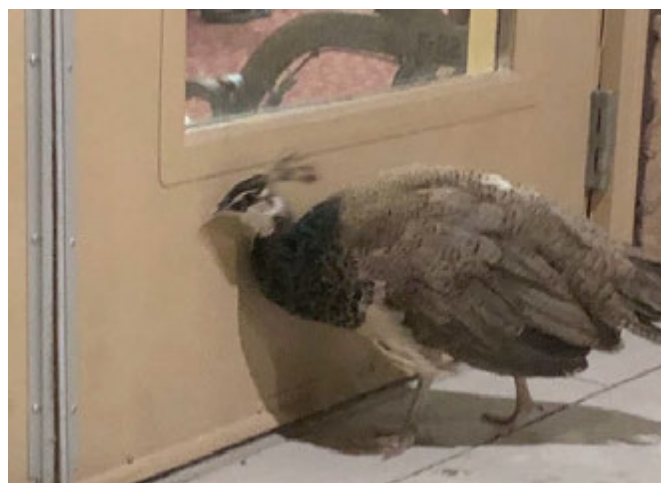
Knock, knock! Let me in!

One evening, we heard a "tapping" on the door during dinner. To our surprise, it was a peacock! Well, it wasn't a one night event — she has been spotted each night (and each morning) roaming around our community. During the day, she is nowhere to be found. We assume she is shopping at the local outlet mall but we aren't sure. We are used to pets here at Alexis Estates — dogs, cats and even a Macaw, but a peacock? That's a first! She even walked right in with a resident one night and had to get "shooed" back out — even random birds are trying to live here at Alexis Estates!