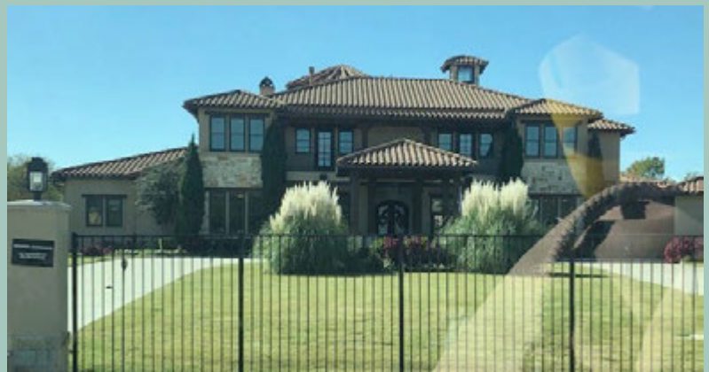
Dak Prescott’s house