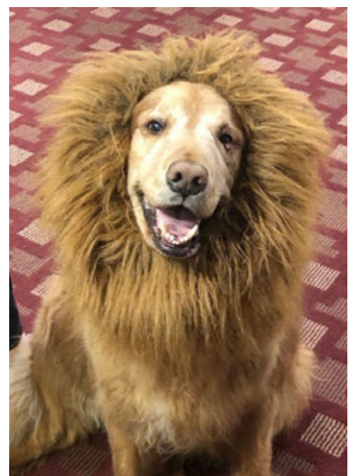
Baxter is the nicest lion we know!