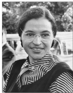
Three other women joined Parks in the Supreme Court battle against bus segregation.

On December 1, 1955, Rosa Parks was commuting home after working a long day at a Montgomery, Alabama, department store. Segregation was written into law and Blacks were required to sit in the back of the bus, with seats in the front reserved for white riders. When a white man entered the bus and found no open seats, the bus driver asked four Black riders seated in the first row of the "colored" section to stand. Three complied, but Parks did