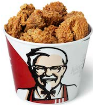
With so few Christmas traditions in Japan, KFC grew to become one of Japan's biggest holiday pastimes.

Christmas brings with it many beloved traditions: trimming the tree, hanging stockings, and singing carols. Many countries around the world enjoy traditions you may be less familiar with.