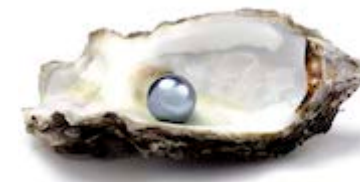
Pearls are the only gemstone to come from a living creature.

December 15 is Wear Your Pearls Day, a day to wear the pearl jewelry that's been hiding out in your jewelry box. It is also a day to appreciate nature's ingenious design. A pearl is created when an irritant, often a parasite (not a grain of sand as commonly thought), invades an oyster, mussel, or clam. To defend itself against the foreign invader, the oyster secretes a