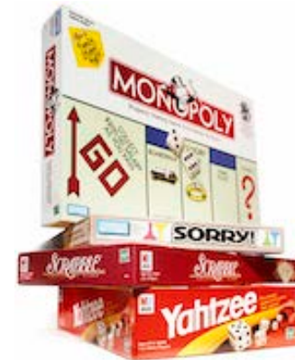
The German Spiel des Jahres award is the highest honor in the board game industry.

Games Day was created in 1975 when an annual gaming convention scheduled for August was canceled. Games Workshop, a British-based manufacturer of miniature tabletop wargames, decided to sponsor their own Games Day to fill the void. On December 20, 1975, the first Games Day was held in Seymour Hall, London, as an opportunity for game enthusiasts to meet each other and play. Today, the UK Games Expo is an annual event held in Birmingham, but for many, Games Day remains a perfect time to play their favorite games, be they board games, card games, video games, or strategy games.