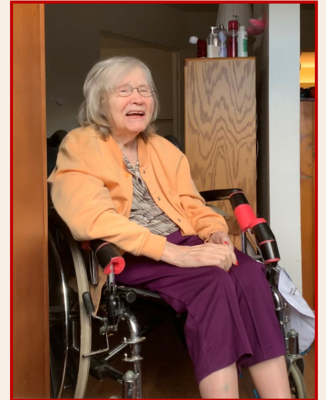
Enjoying the music coming through window!