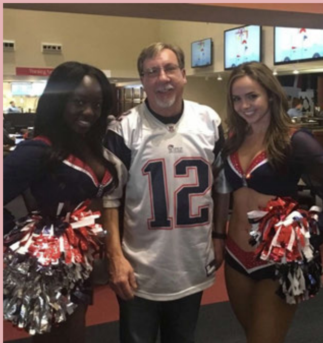
Not my wife and I (Look at my hands ... my wife took the picture.)