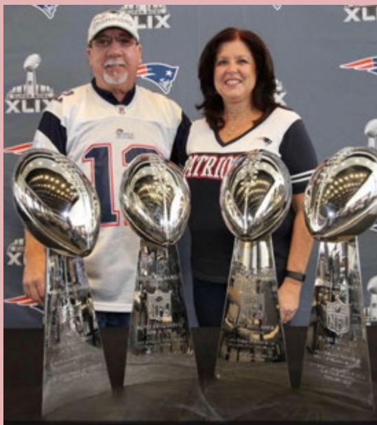
My wife and I

that I forgot it at home during a business trip to North Carolina and another time that I only had one arm through the sleeve as I groggily watched the game while recovering from having my gall bladder removed. I've been to games when the weather was fine and others where the beer iced up by the time you got back to your seat. My first game was 25 degrees with a 15 mile an hour wind and snow squalls. Patriots 49, Jets 3. What an experience!