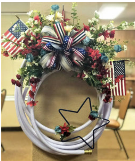
Fire hose wreath