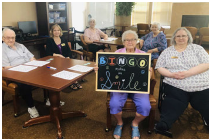
Bingo makes our residents smile.