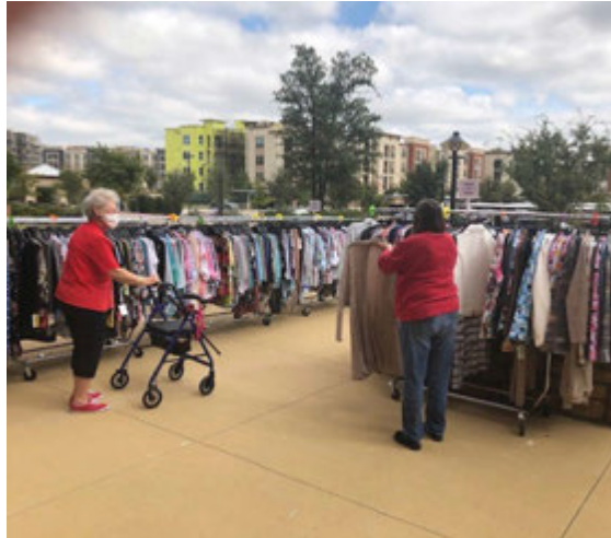
Residents enjoyed the cooler weather while shopping outside.

Good-bye, 110 degrees, hello 80! We are finally getting nicer weather, so we are bringing back our vendors that we have missed so much, as well as our favorite singer! When Famous Brands Clothing arrived, we had a line of ladies ready to shop! Before he left,