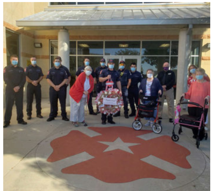
We went to donate the wreath at the Central Fire Station.