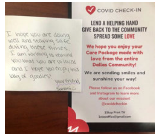
One of the handwritten notes and the organization's card