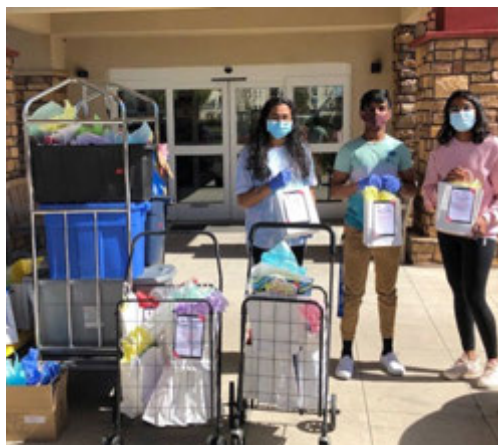
The great kids brought in 128 bags for our residents.

Back in September, a group of kids through "COVID Check-In" called us and asked if they could bring gift bags for all of our residents. Of course we said "Yes"! They are a group that puts together gift bags containing snacks, books, puzzle books, coloring books and colored pencils, and every bag had a handwritten note to the residents. We delivered them to each resident one morning and spent the rest of the day listening to the residents gush over how amazing and thoughtful the kids were. We are getting a big thank-you card together for all of the residents to sign. The group simply wanted to let seniors in the area know that they are loved and hopefully give them some joy by the generous gift. They succeeded!