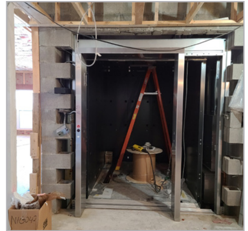
Elevator install happening