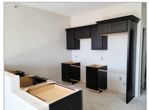
Cabinets being installed in IL apartments