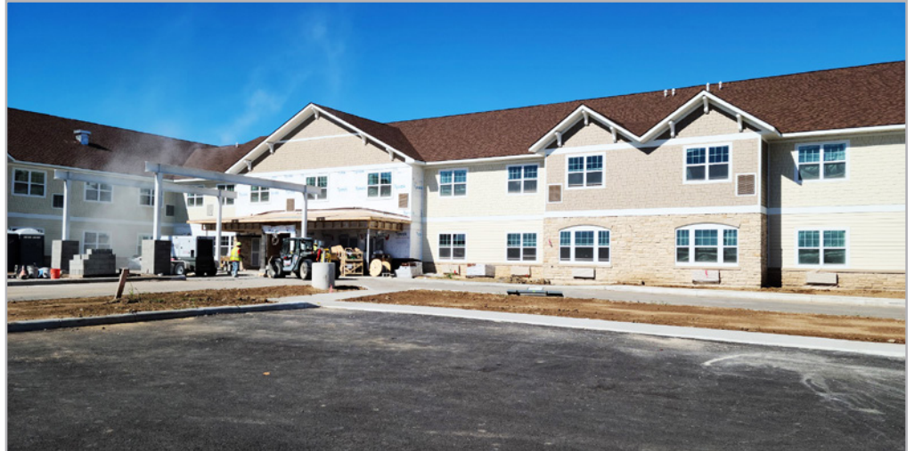
Exterior update – siding and stone all around building (picture of AL & IL entrance)