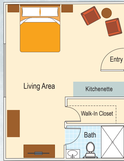
Studio (347 sq. ft.)