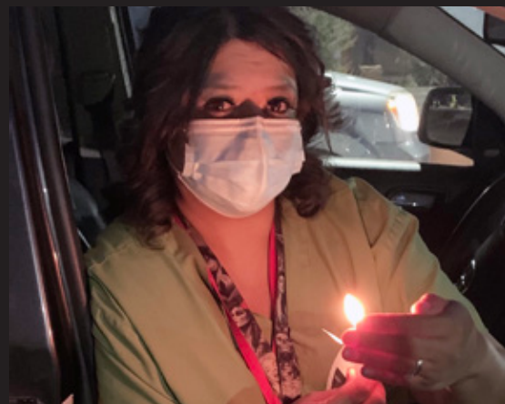
We all need a positive message.