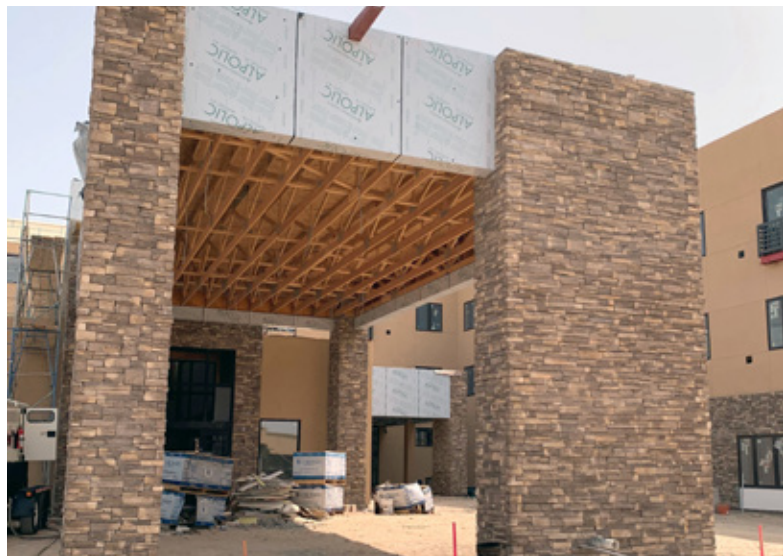
Portico stonework is complete.

Things are really moving forward at Amaran Senior Living. Drywall is complete, the entry portico stonework is finished, and the Juliet balconies are being primed and painted for installation. Completion is scheduled for November 1, 2020, and we will be ready to welcome our residents to their new home shortly after. We are incredibly excited to keep sharing the updates with you and scheduling tours as soon as we get the green light to do so.