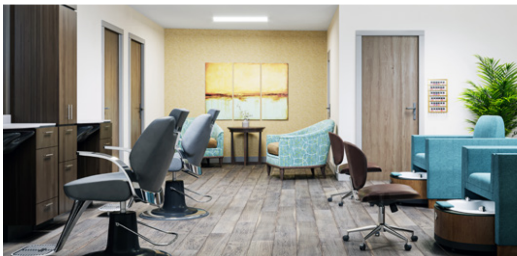
Full-time Salon Services with Massage Therapy to pamper yourself.

Quality care is the foundation of our community, and our beautiful amenity spaces are the cherry on top. We are proud to show you what to expect at Amaran Senior Living. We feature thoughtfully appointed amenity spaces that convey luxury at a competitive price point.