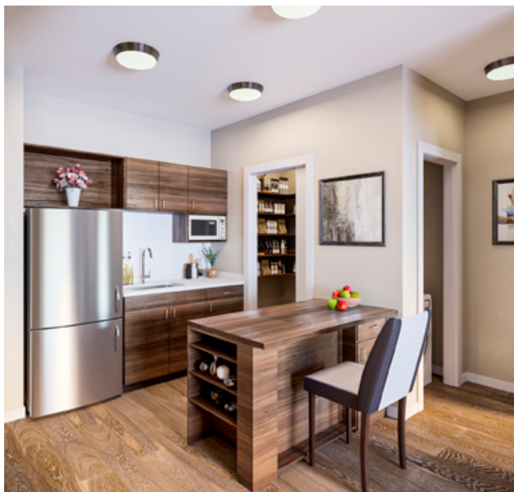
640 sq. ft. 1 Bedroom Apartment – Kitchenette with Walk-in Pantry.

Quality care is the foundation of our community, and our beautiful amenity spaces are the cherry on top. We are proud to show you what to expect at Amaran Senior Living. We feature thoughtfully appointed amenity spaces that convey luxury at a competitive price point.