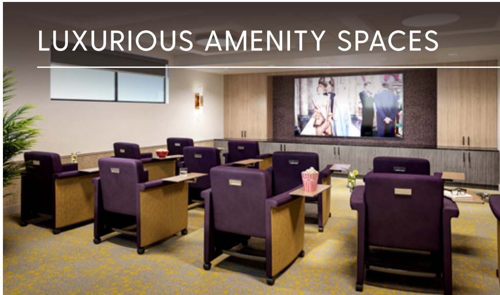
Theatre with meal and beverage service available.