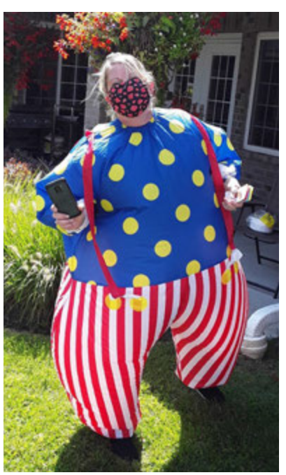
Just clowning around!

A fun fair: A gathering of people for a variety of entertainment or commercial activities. It is normally of the essence of a fair that it is