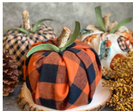
DIY Toilet Paper Pumpkin Décor!

This is a great time to sit down relax and think about what we are all thankful for. This craft is a simple addition to your fall décor, and a fun reminder of all the things, big and small, that we have to be thankful for.