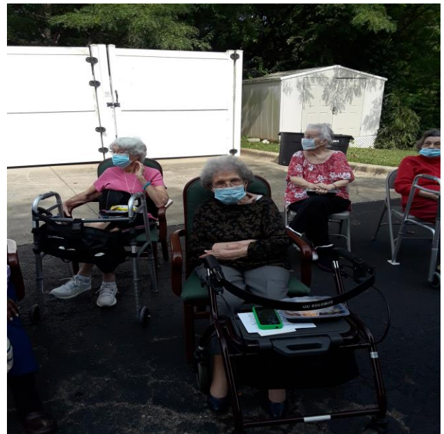
Attending an outdoor Bluegrass Concert

We would love to hear from you if you have a dream idea for any of our residents! Please contact any team member with your ideas!