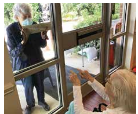
To keep everyone safe and healthy during COVID-19, family visitations have taken a creative turn!