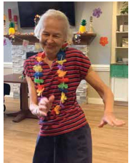
There were grass skirts, leis, coconuts and pineapples galore at the Foothills luau.