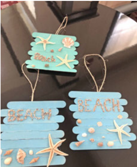
Beach signs made out of popsicle sticks

To celebrate the summer, we had a beach party! We decorated the Activities Room with colorful fish, seashells, starfish, fishnet, flip-flops and of course, beach balls! Prior to the event, residents made beach signs out of popsicle sticks decorated in shells and starfish. Residents were served fresh fruit, along with fruit dip and coconut cookies. During the party, residents took turn pinning the teeth on the shark! The residents had to spin around in a circle five times with a blindfold on. They were then given a set of teeth to pin on the shark. The crowd shouted out directions to their blindfolded friends who were walking in all different directions to get to the shark. Even Bus Driver Keith joined in on the fun; he almost pinned his set of teeth on the window blinds! Although no one actually pinned the teeth on the shark, resident Nancy came close and ended up winning the prize. The prize was gummy lobsters that tasted like Swedish Fish. It was a fun day filled with laughter and a great way to end the day!