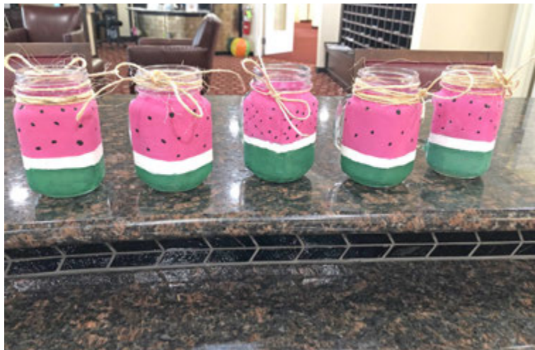
Watermelon mason jars