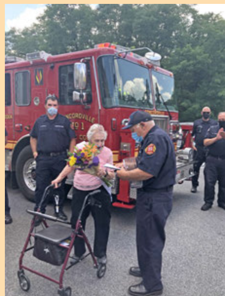
Flowers for our special lady!