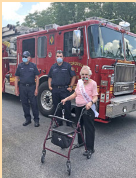
Thank you, Concordville Fire and Protective Association, for joining in on the celebration!