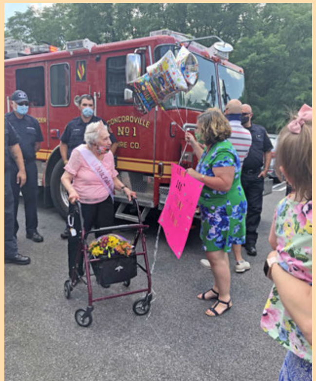
Thank you, Concord Township Council Members, for celebrating with us!