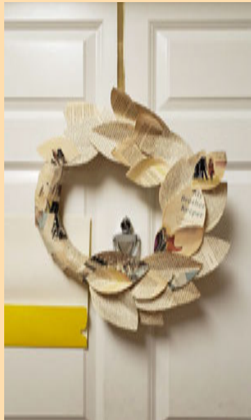
Magnolia Book Wreath