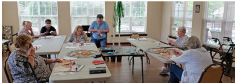
Everyone busy at work cutting leaves out