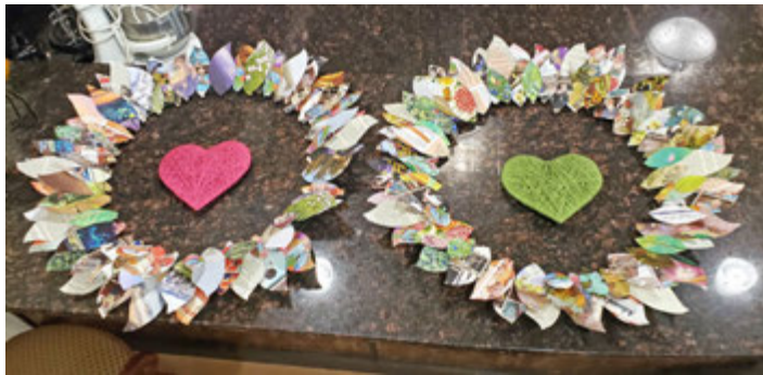
Wreaths created from our old newsletters, old calendars and old books