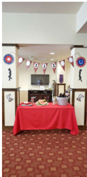
Rootin’ Tootin’ Bar