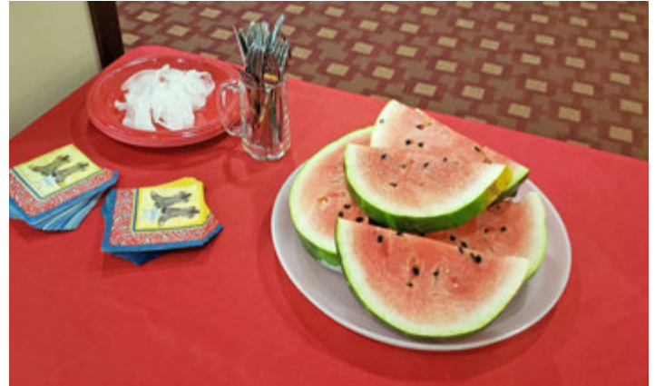
Cold watermelon for the spectators