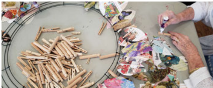
The leaves are being added.