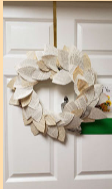
Magnolia Book Wreath