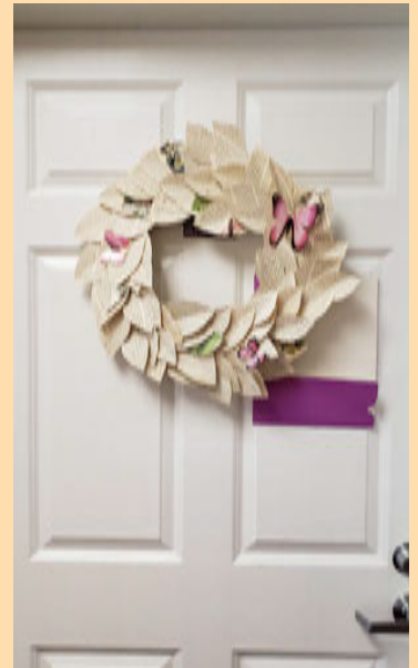
Magnolia Book Wreath