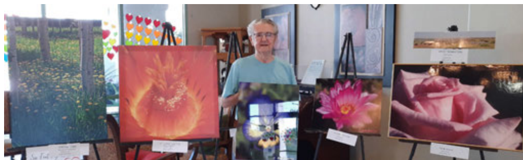
Stunning photos with center of cactus and flowers