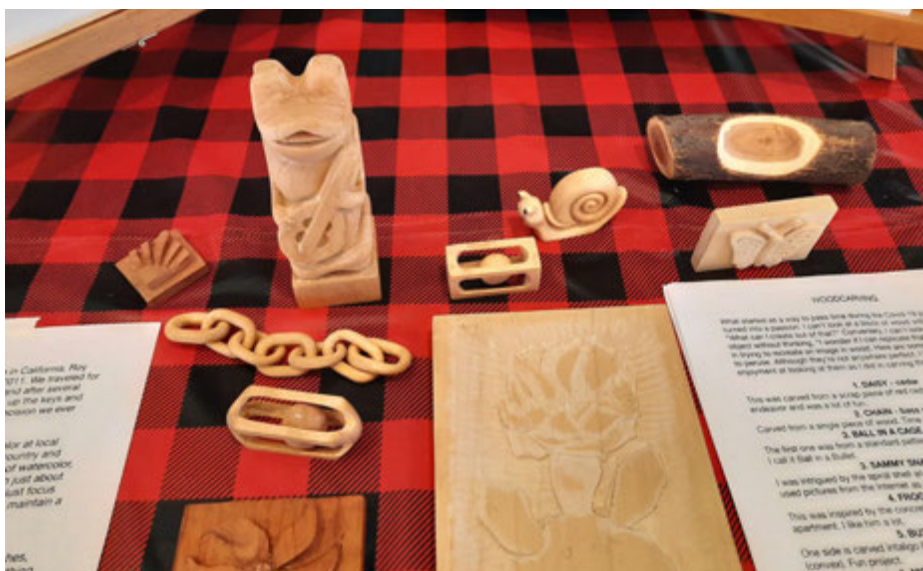
The Daisy was his first endeavor and was a lot of fun.

Thank you for sharing with us. We really enjoyed it and it's very impressive!