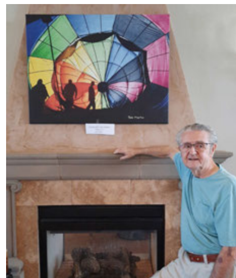
"Hot Air Balloon"