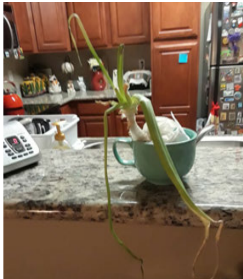
Onion starting drooping