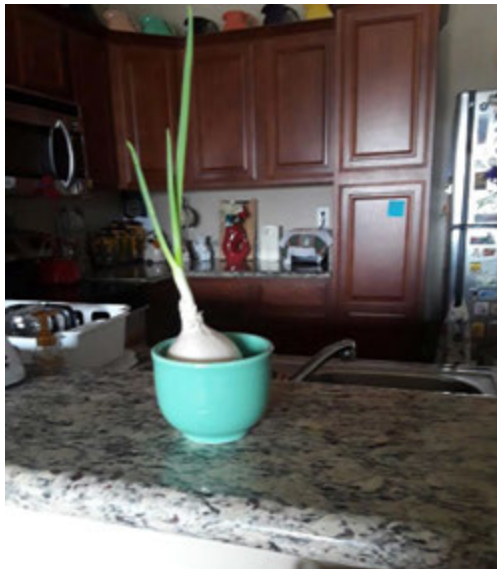
Onion plant sprouted well

It grew for months, and I did love it so. Just in a cup; no water to sustain. And then I saw that it began to slow, To droop and dry, to smell, to be a bane. My onion plant I loved with all my heart. Then came the day when we were forced to part. May 28, 2020