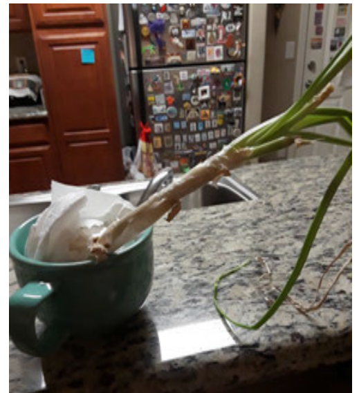
The day we parted