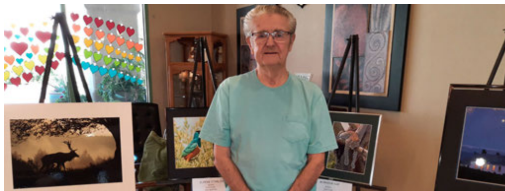
Pictures from Washington and Tanzania; the Elk and Leopard are favorites