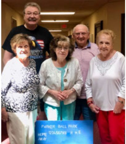
The Parker Diamonds