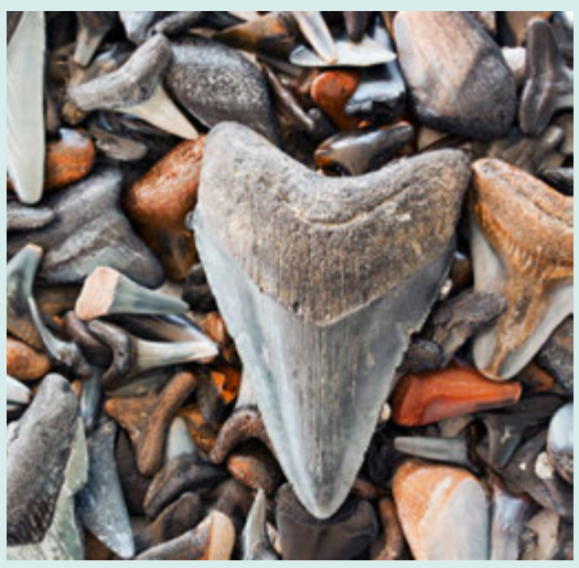
Venice, Florida, Shark Tooth Capital of the World