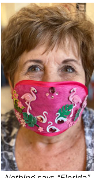
Nothing says "Florida" like flamingos!