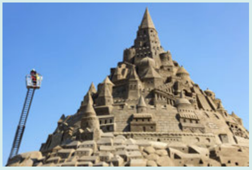
58 ft. Sand Castle, Binz, Germany