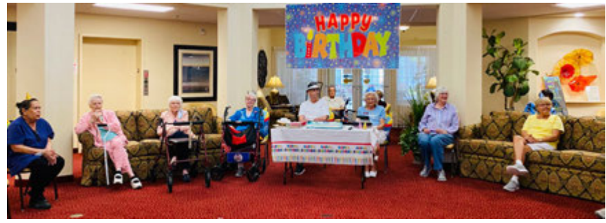
June Babies Birthday Celebration