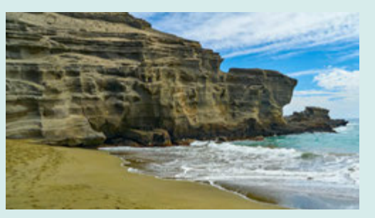
Papakolea Green Sand Beach, Naalehu, Hawaii