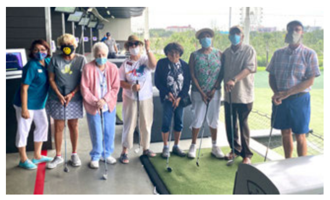
Top Golf was a fun and safe adventure.