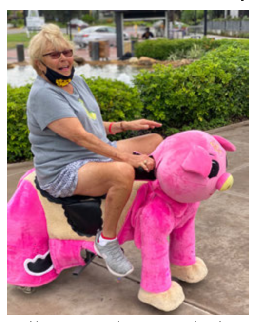
Here comes danger on wheels