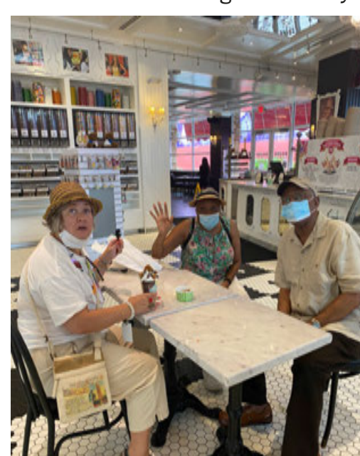
Quick sugar fix