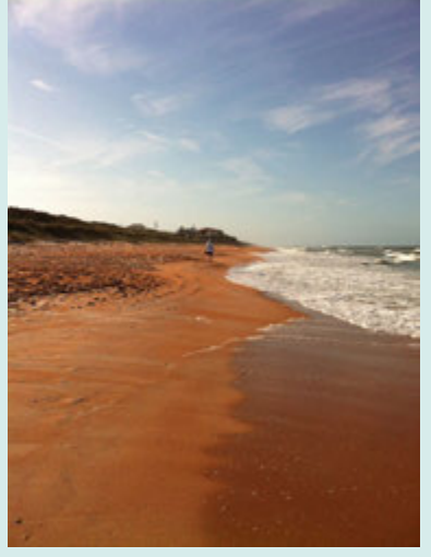
Red Sand Beach, Flagler, Florida