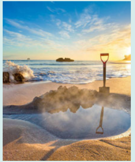
New Zealand Hot Water Beach

"Let's Make Learning our Great Adventure!"