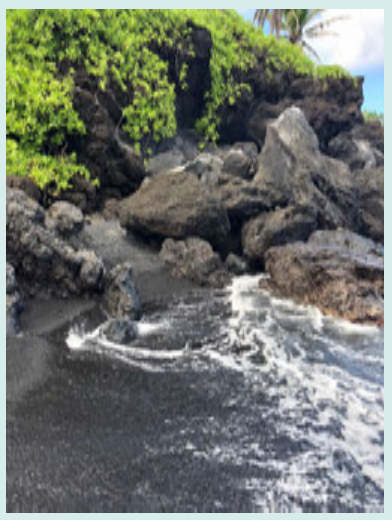
Black Sand Beach, Maui, Hawaii