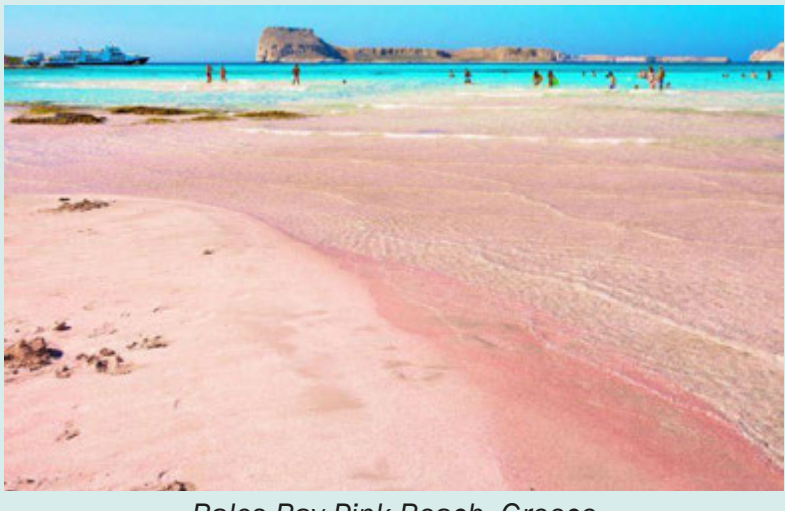
Balos Bay Pink Beach, Greece