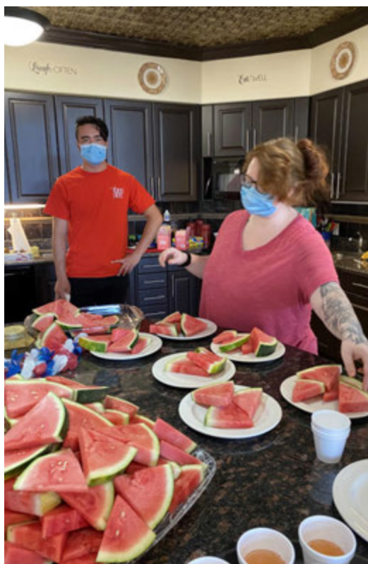
Setting up for watermelon eating contest