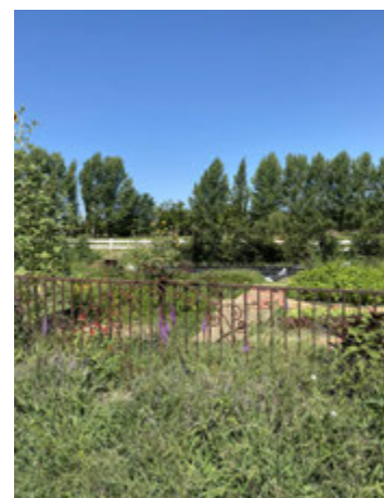
100 percent organic vegetable garden