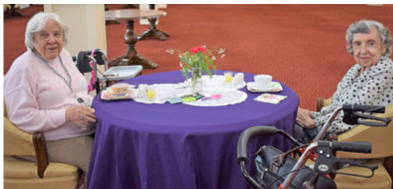
"Tea! Bless ordinary everyday afternoon tea!" — Agatha Christie