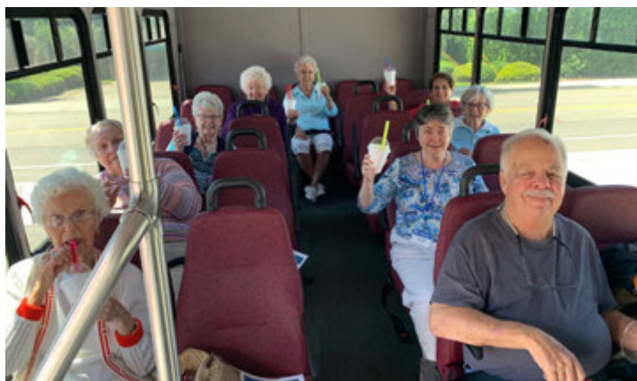
Mystery Drive for surprise milkshakes!