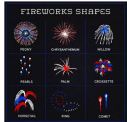
Different firework shapes