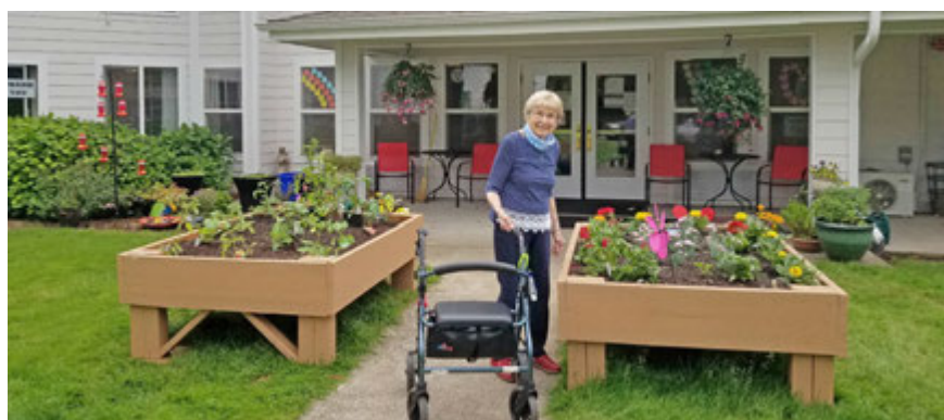
Plants are looking better all the time.