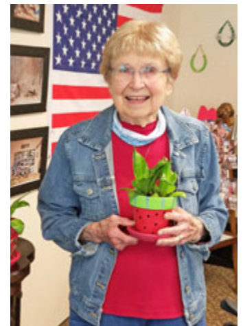
Our beautiful plants and pots that we painted