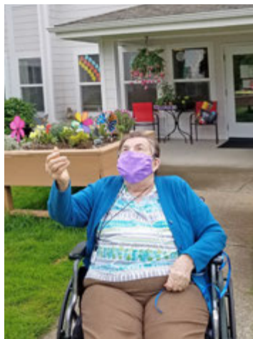
Florence is sending a message to heaven as well.