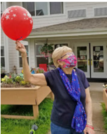
Grace sending a balloon and message to heaven on Memorial Day