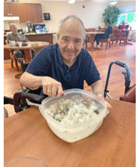
Foster mixing together homemade lavender sugar scrub