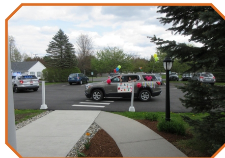
Drive by parade