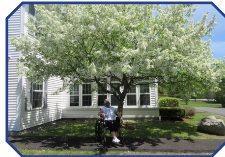
Maggie under the Spring Blossoms on a warm Spring day