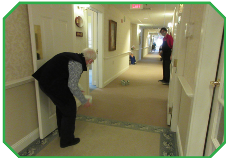
Toilet Tissue Bowling Thera