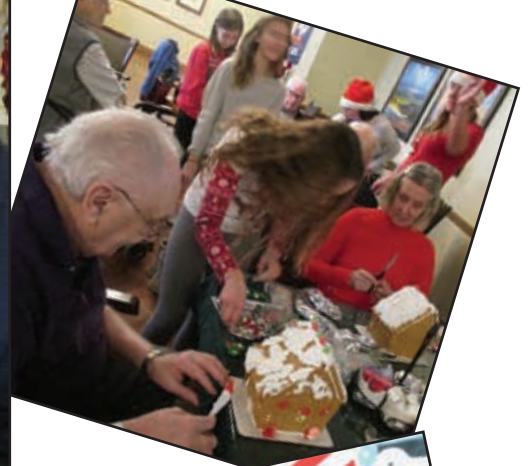
Gingerbread houses and photo cards — they all spell Christmas at ESMRC!