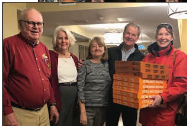
Left: Members of Heritage Chapter hosted a pizza and delicious cookie party for residents. YUM!