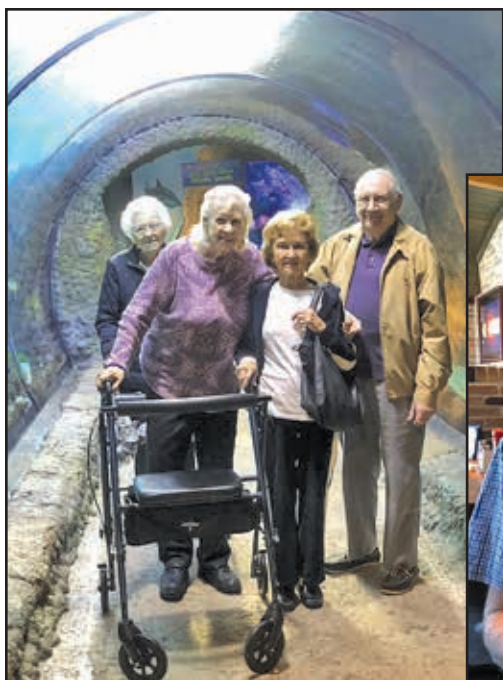
ESMRC residents went to the Aquarium and on a trip to see the fall colors