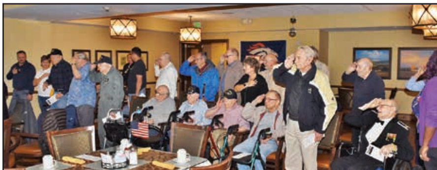
Left: Veterans Day, Nov. 11, drew a crowd of folks — residents and guests — to honor the veterans at ESMRC and remember Armistice Day.