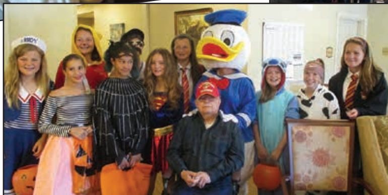
Memory Care residents enjoy the holidays — Halloween and Christmas — learning crafts from staff or visiting volunteers, then participating in the parties.