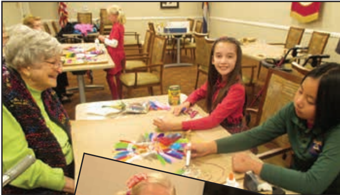
Students from Cherry Creek Academy visited at Thanksgiving time. They did their annual Turkey artwork with the residents.