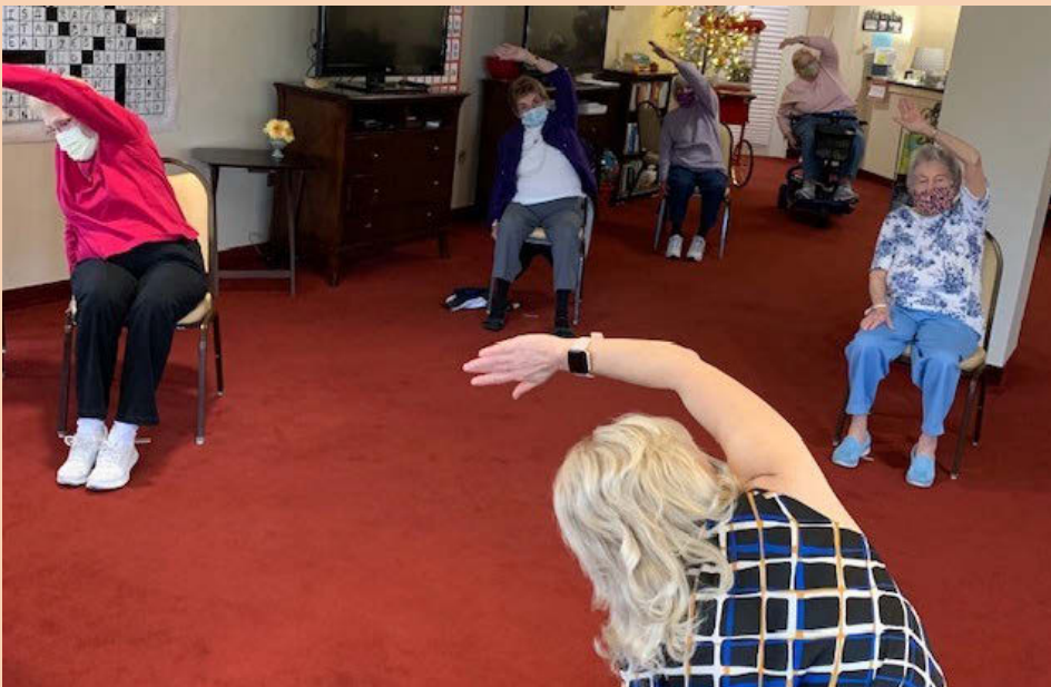
Safely distancing while keeping fit