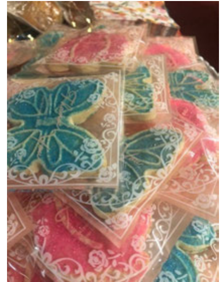
Pretty sugar cookies were served during the tea party.