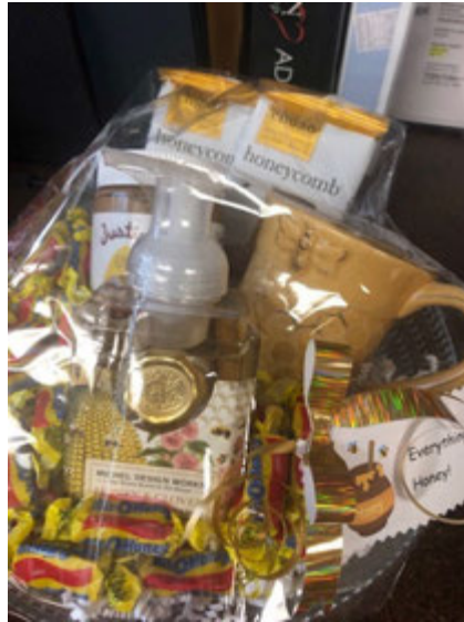
Our "Everything Honey" gift basket

Somehow, despite the unusualness of it all, our Sterling Heights mothers enjoyed their special day. Visits with family members were heartwarming. Flowers filled the building as families sent warm wishes for a happy day, and much joy was brought to all as our mothers were still able to enjoy their annual tea.