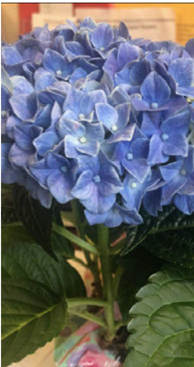
Our raffle included these beautiful hydrangea plants to warm any woman's heart.