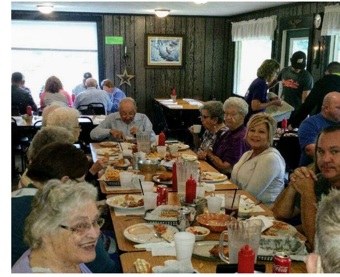
Above left: Group shot of the residents and staff who enjoyed our wonderful lunch outing to Bluff Lake. Above right: A group shot of residents and staff enjoying their meals at Bluff Lake.