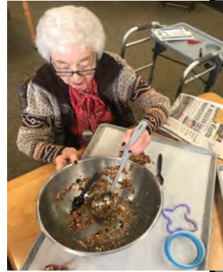
Homemade Bird feeders