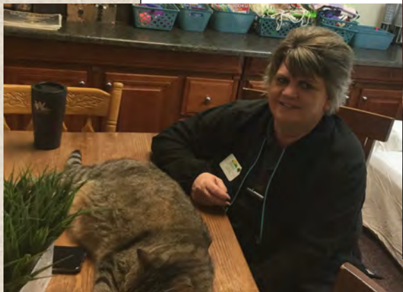
Lunch at Bills