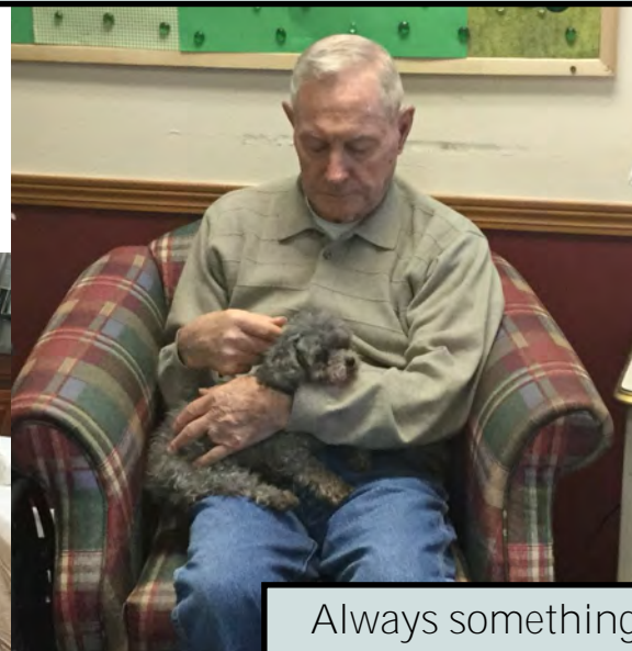
Always something going on! From Pets to Crafts & Music!