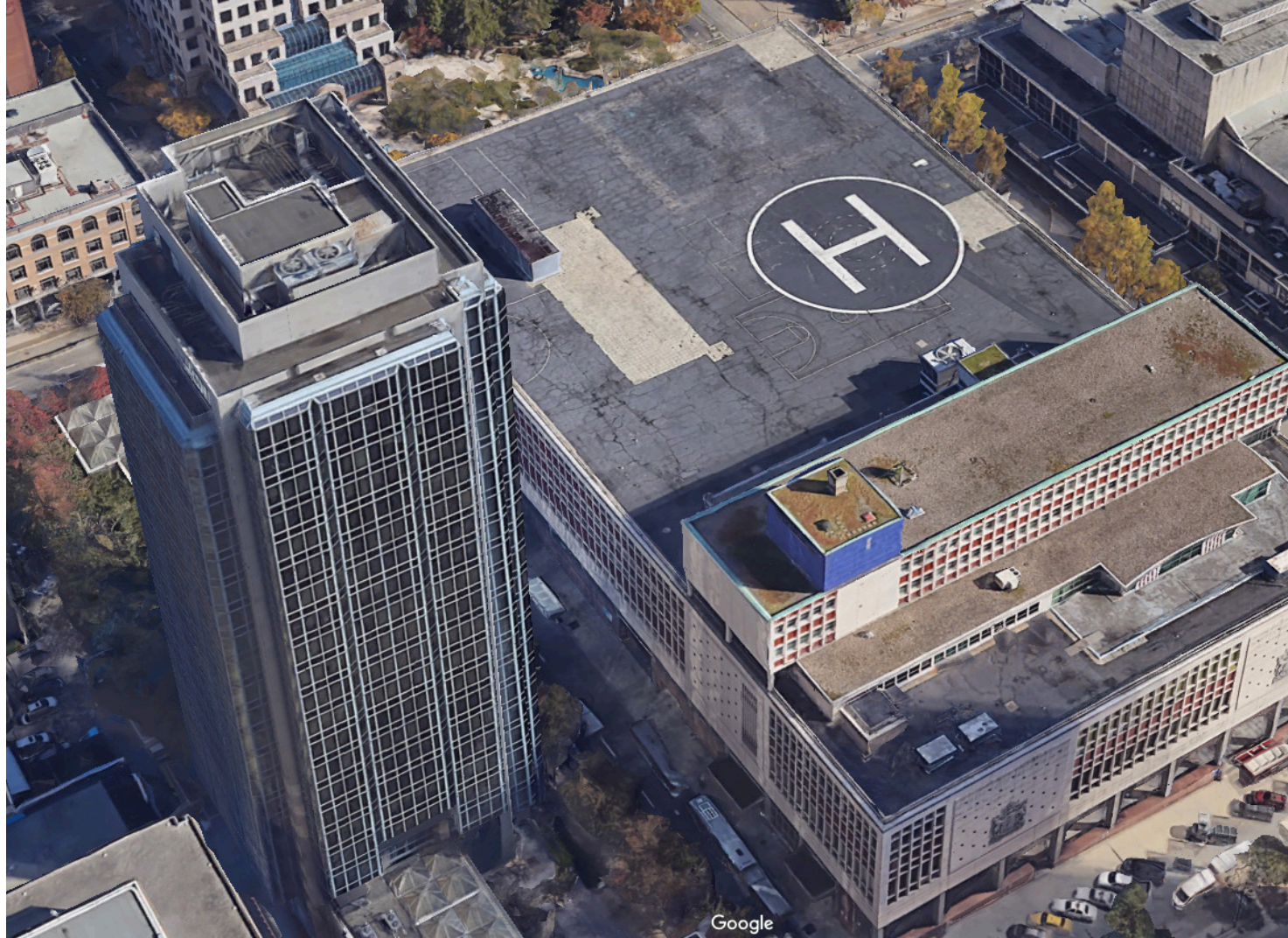
Canada Post building before construction