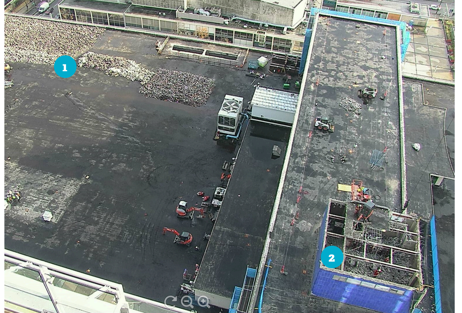
1 Asphalt and concrete topping being removed