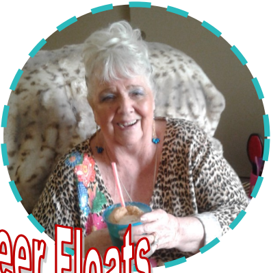
Root Beer Floats