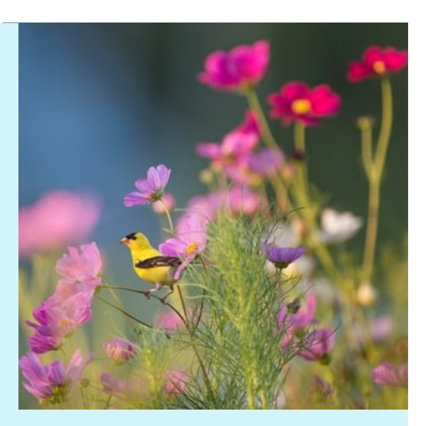
Our mission is to create and sustain comfortable, caring environments for those who depend on us.