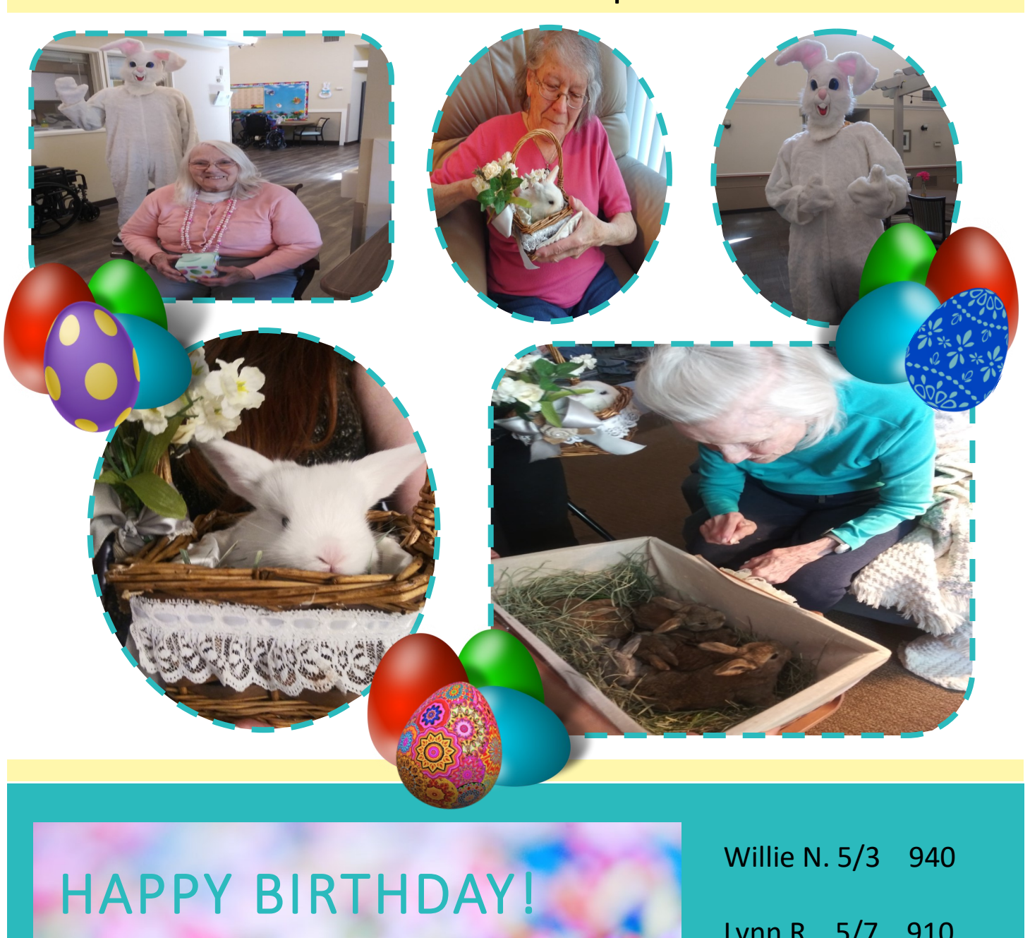
Special Easter Moments