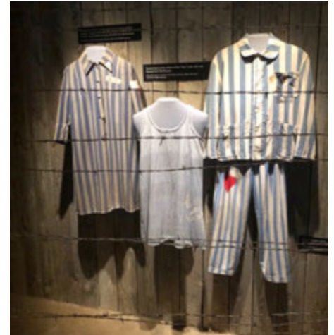
Clothes worn at the camps