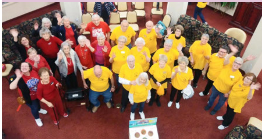
Red versus Yellow — the gang's all here!