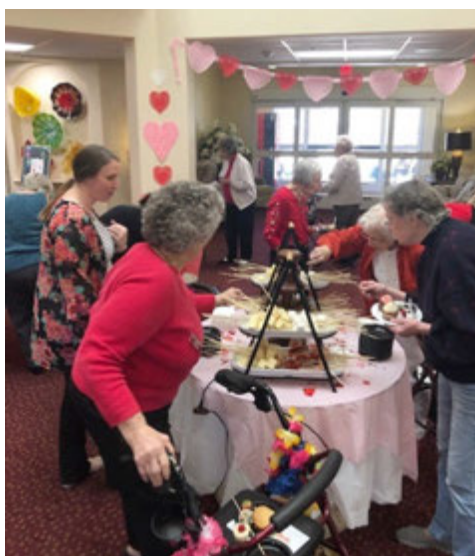
We need a bigger to-go box!