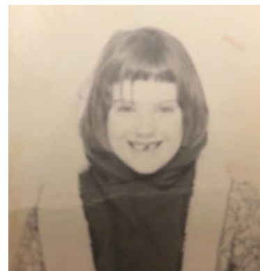
Who am I?

If you can guess who is in the photo, stop by Lynn's desk in the Activity Room for funny money!