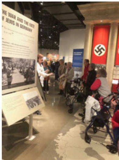
We were listening to her speak about how the Holocaust affected different countries.