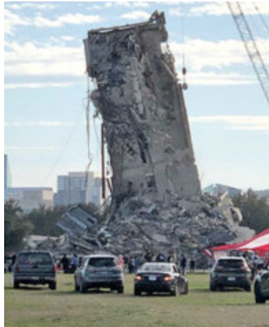
The Leaning Tower of Dallas

We had a bus load of residents signed up to go visit the Holocaust and Human Rights Museum in Dallas. Although we all agreed it was very sad, it was a huge part of history and an extraordinary time. We read the facts throughout the museum, saw artifacts from the camps, and watched videos of survivors and other individuals. It was rough to hear some of the stories, but it was an extremely educational day and we were all surprised at some of the things we learned. On the way there, we saw the famous "Leaning Tower of Dallas" so, of course, we had to get a picture. It was completely demolished two weeks later.