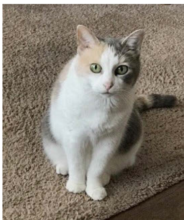
Callie, ready for some petting.