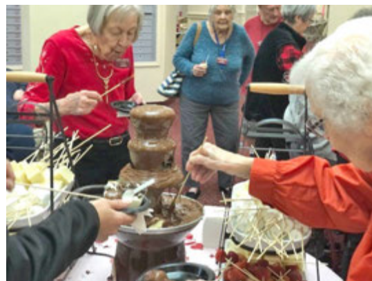
The best part!

On Friday, February 14th, at 2 p.m., we had a big Dessert Extravaganza! We had cookies, cupcakes, pies and the chocolate fountain! Our residents and friends enjoyed dipping the angel food cake, pineapple, strawberries and marshmallows in the chocolate. It was a special treat for Valentine's Day and everyone enjoyed it! We didn't have many leftovers after that event! Yum!