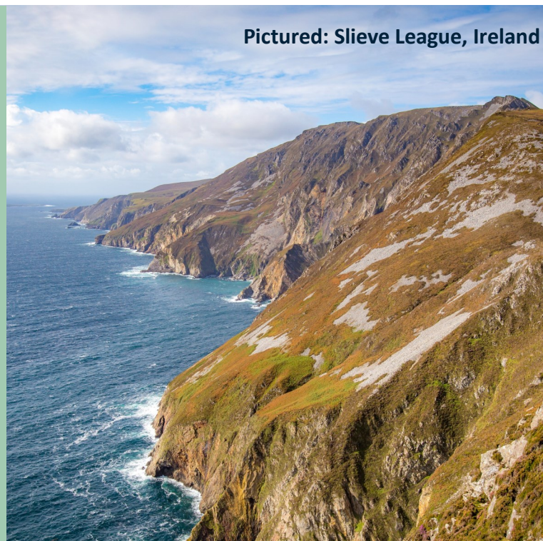
Pictured: Slieve League, Ireland

Our mission is to create and sustain comfortable, caring environments for those who depend on us.