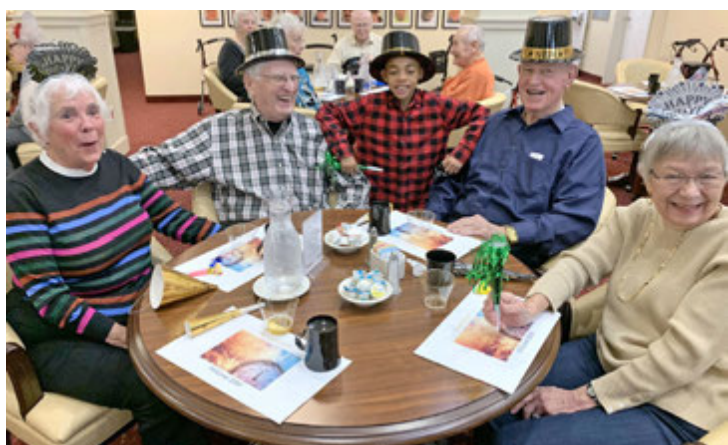
Celebrating in Shanghai