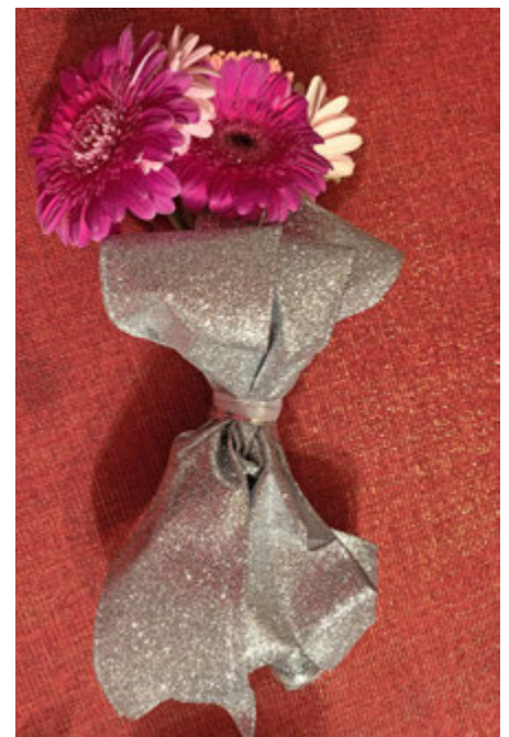
The Love Bouquet

On February 29th, leap into 2020 with a roaring '20s Party. Get your wardrobe ready now.