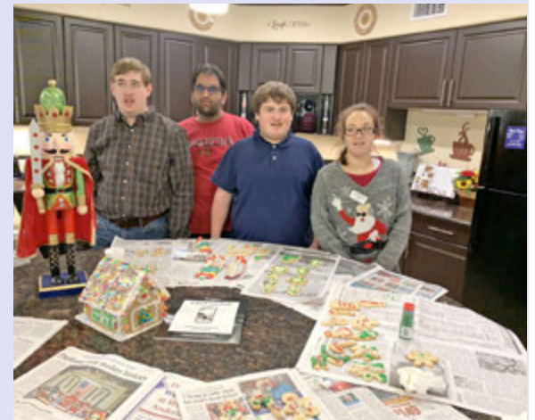
Our Garnet Valley Stars decorated dozens of cookies before they went home for Christmas break.