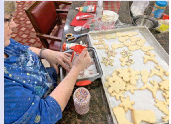
Residents make sugar cookies for our neighboring students to decorate.