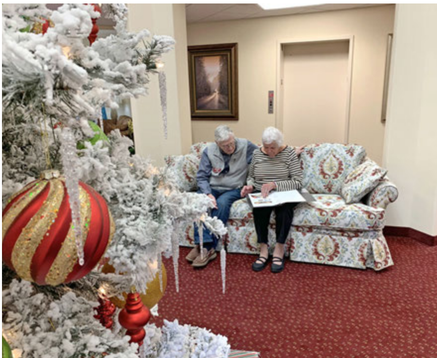
Sharing a quiet moment together by the tree on Christmas Eve