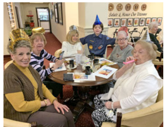
2019 turns into 2020.

New Year's Day was just as fun, as the residents celebrated Philly-style, while watching the Mummers Parade and enjoying Philly hoagies with all the accompaniments, yummy soft pretzels, and, of course, Tastykakes! We were also so lucky to have Cub Pack 2 help us to distribute the noisemakers and have fun with the residents.