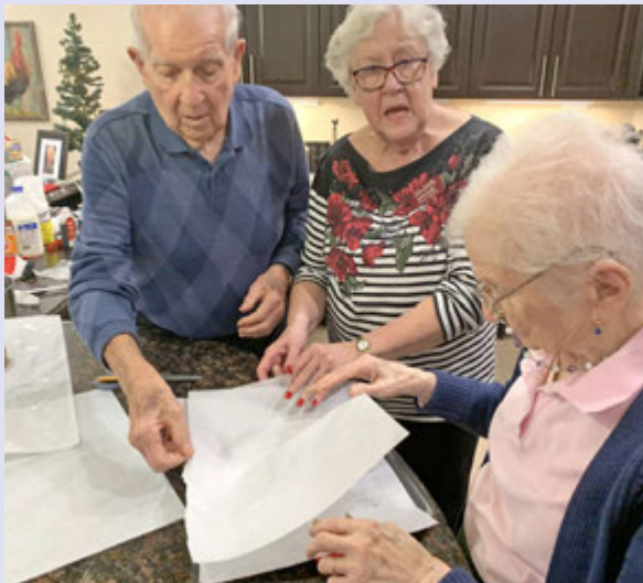
More yummy cookies for our community service volunteers

Ivy Creek has not even been open for a year yet, but we have made so many positive connections in our community. We have hosted several events for our Concordville Township officials and community volunteers, to thank them for their overwhelming support. We also participate in the Community Living and Learning Program, where we assist Garnet Valley High School students that have significant cognitive impairments to learn and practice independent living skills in an authentic environment. Ivy Creek welcomes four to eight students three times per week to help us with our hands-on real life experiences training. Our youth help us set tables in the Dining Rooms, vacuum the common areas, dust the stairwells, and help clean the Activities Room. We are so proud to help these transitional students gain experience in living skills, social adaptability, improving self-determination, and providing them with a loving and supportive environment. After the kids are finished with their duties, what is their favorite reward? Ice cream, of course, in the Activities Room, chatting with the residents. We love our kids!