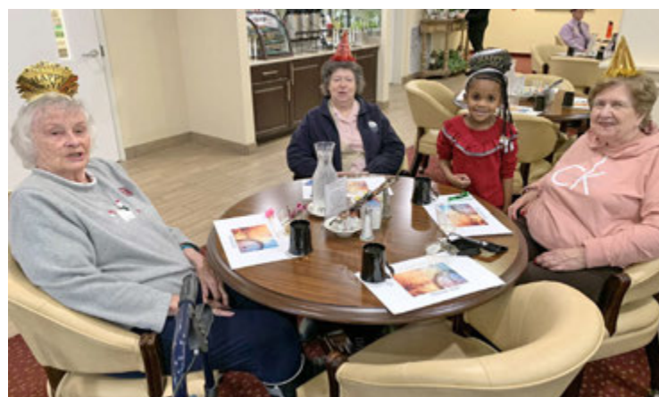
Counting down with the Cub Scouts.