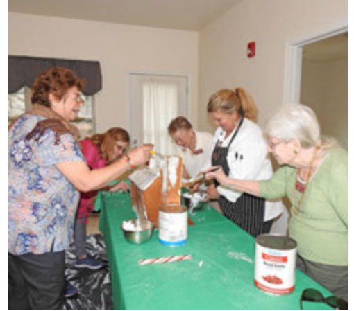
Painting the house with royal icing.