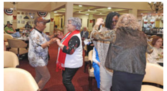
Residents and visitors dance