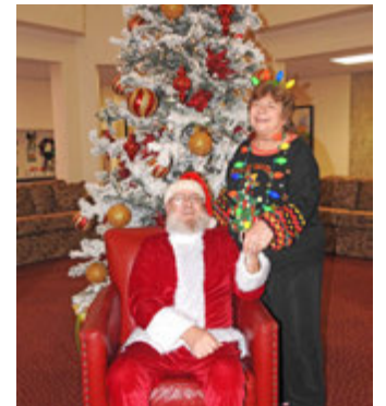
Rosa sparkles with all her lights!