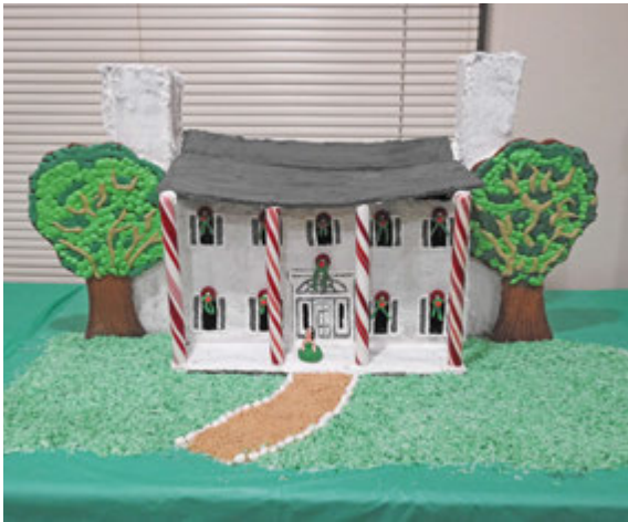
The finished product.