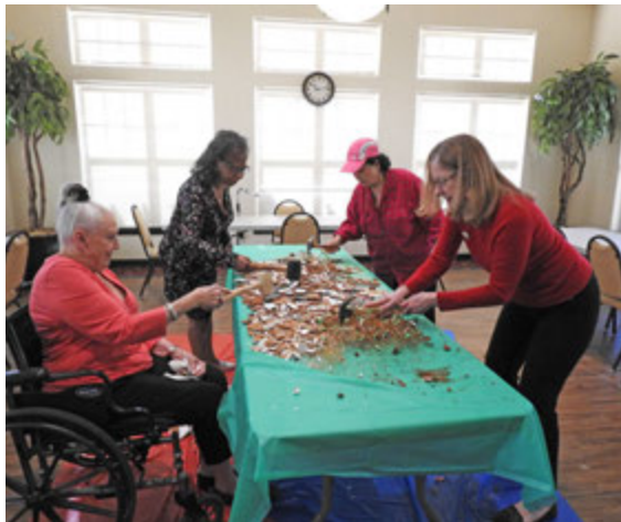
Gingerbread House smash!