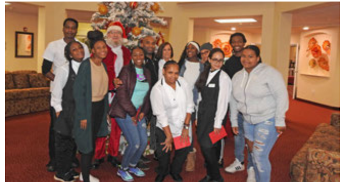
Staff pose with Santa

Residents and staff joined together for a Christmas party. Staff received their bonus from residents, and we played a guessing game to see how well the residents know our staff. It turned up some surprising results. A couple of staff used to race dragsters, one wrestled alligators, one was a beauty contest winner and one was a 400-meter racing champion at his high school. The party wasn't complete without a visit from Santa!