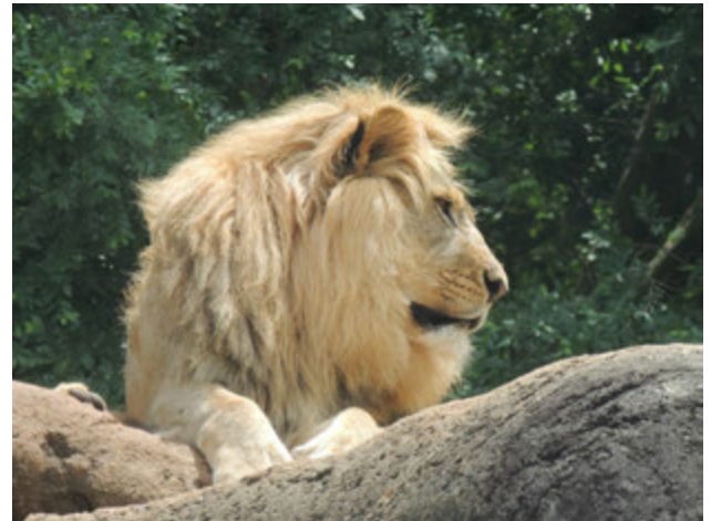
The mighty lion

Our final Hawthorn Expedition in the first week of February will be to the African country of Tanzania. Africa's highest mountain, Kilimanjaro, is located here, as well as wildlife-rich national parks, such as the Serengeti. We will celebrate this beautiful country with food, crafts, history and culture.