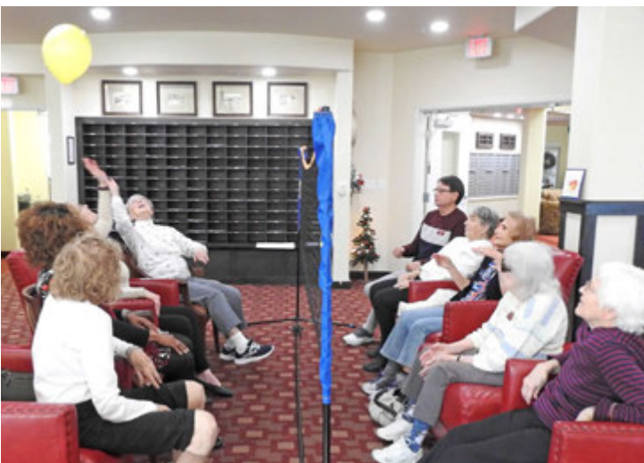
Stretching to get the balloon

Balloon volleyball continues to be a fun way to exercise and laugh together. At the end of the session, each person is given a writing pen to see who can pop the balloon in mid-air.