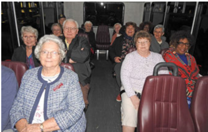
Ready to see Nights of Lights

One of our Christmas outings was to visit the Nights of Lights at Lake Lanier. Each year, they put up miles of beautiful Christmas lights and scenes to drive through in a car or bus. It was a wonderful way to enjoy the holiday season.