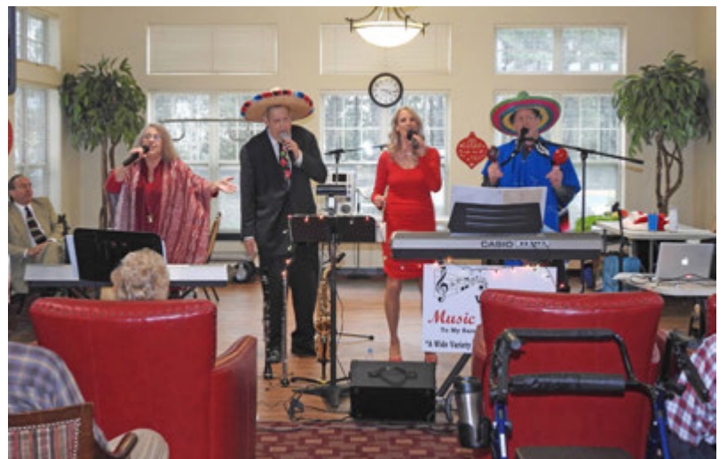
South American Christmas songs

We had a good crowd that gathered to hear the group "Music to My Ears" perform international Christmas songs. We heard songs from South America, Israel, Ireland, Polynesia, the USA, and more. It was a great way to get in the holiday spirit!