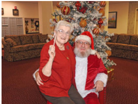
June tells Santa she has been good all year!