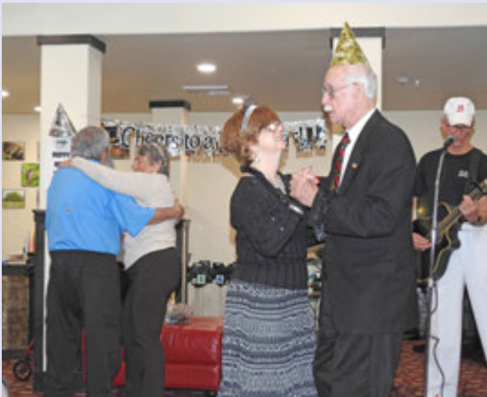
Dancing the last dances of 2019.