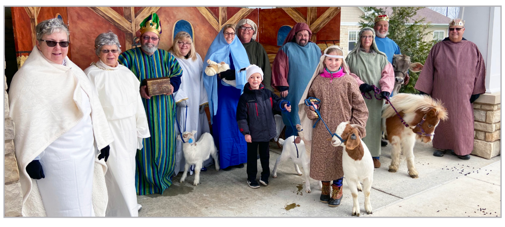
Our Live Nativity was a success!