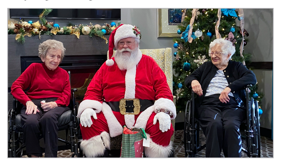
We completed our festivities with a visit and personal gifts for everyone from Santa!

Wooded Glen celebrated the holidays filled with memories, trips, laughter, music and special guests of all ages. Here is a look back at some of the fun memories!