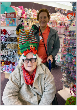
We enjoyed a day filled with Christmas shopping at the mall!