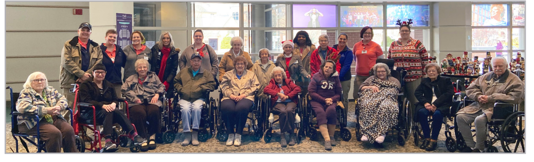
Wooded Glen enjoyed a wonderful day with Forest Glen watching a production of the Nutcracker.