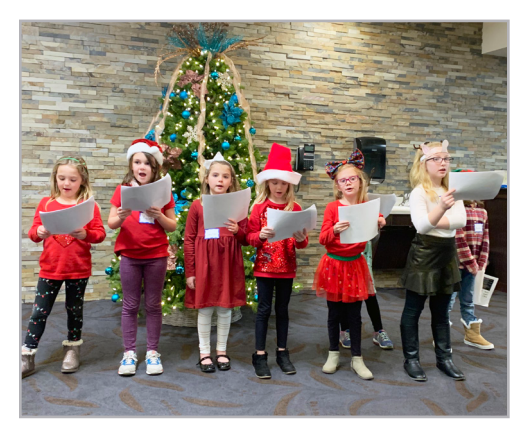
A local Girl Scout Troop came to Carol the halls at Wooded Glen!