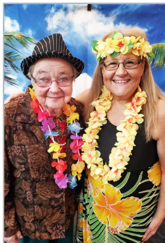
January Themed Happy Hour