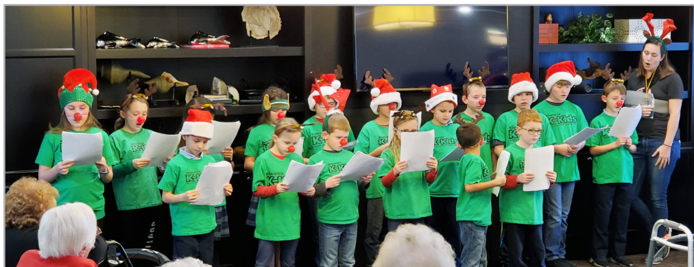
The K-Kids have beautiful voices!

During the holiday season, we had the Delphos Jefferson show Choir, K-Kids, and Tender Times come to give us joy!