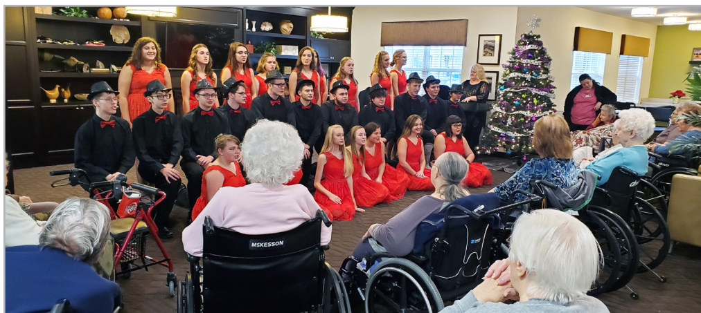
What a great performance!