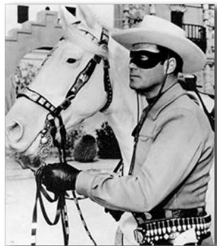
The Lone Ranger was found by Tonto as the sole survivor of a group of Texas Rangers that were ambushed.

On January 31, 1933, a Detroit radio station hit broadcasting gold when it aired the first episode of a western series called The Lone Ranger . It was an instant hit which led to a spectacular run of 2,956 radio episodes. The Lone Ranger phenomenon became a cultural touchstone for an American nation hungry to romanticize its Wild West roots.