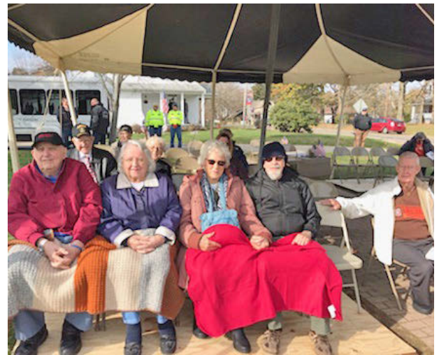
All bundled up!