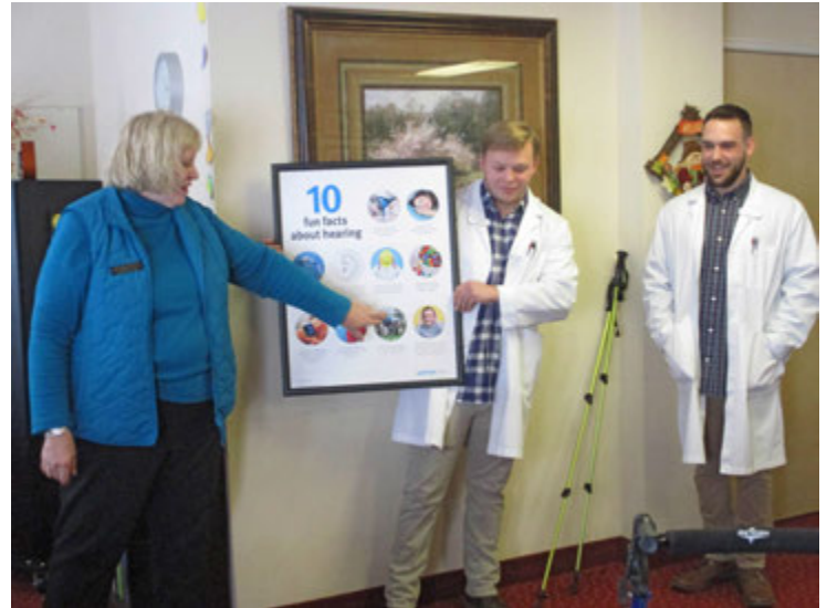
The audiologist team from Advanced Eargear give a presentation.