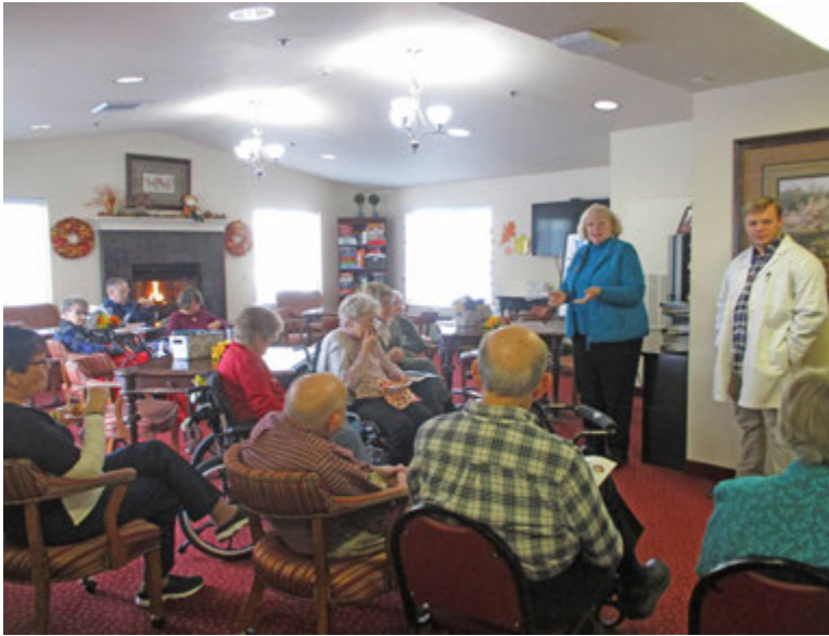
Learning fun facts on the importance of hearing.

Our residents were “all ears” during a very special hearing screening event provided by our good friends at Advanced Eargear. Residents gathered in the Activity Room for an educational presentation on the science and importance of hearing. As hot coffee and delicious donuts were served, residents had the opportunity to ask questions and learn a few fun facts about all that their ears can do! After the presentation, residents could sign up for a complimentary hearing exam and be entered in a drawing to win a 32-inch flat screen TV! A special thanks to Advanced Eargear for providing us with a wonderful presentation and service.