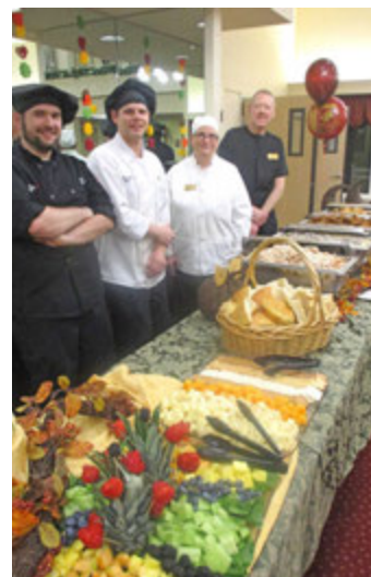
We are thankful for our Culinary crew!