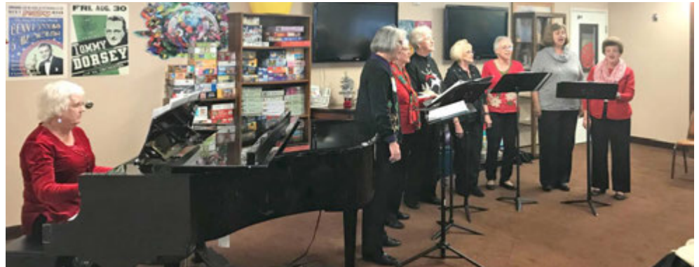
One Voice in song