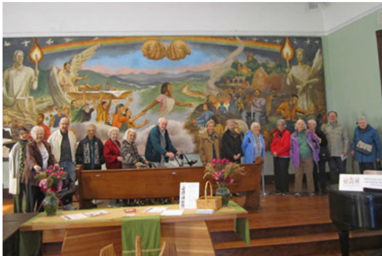
Bella Vista residents, admiring the artistry of the fresco.

Affirming sacred worth, restoring human dignity, and sabotaging the shame of poverty, the Haywood Street Fresco announces, in plaster and pigment, that you matter. Thank you, Haywood Street, for truly practicing what you preach.