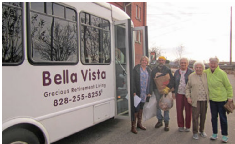
April and another companion met us at the bus to help us unload.