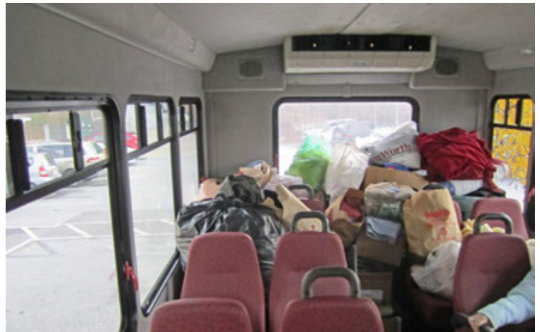
Donations for the clothes closet completely filled the back of the bus.