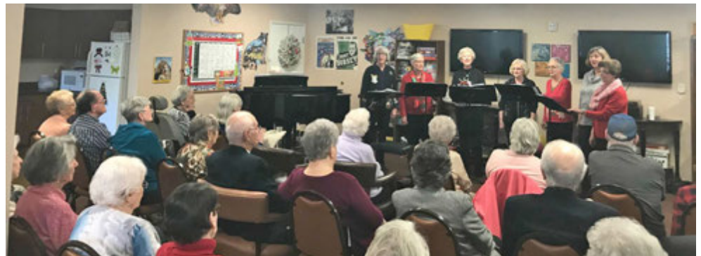
The Activity Center was full to capacity with music lovers.